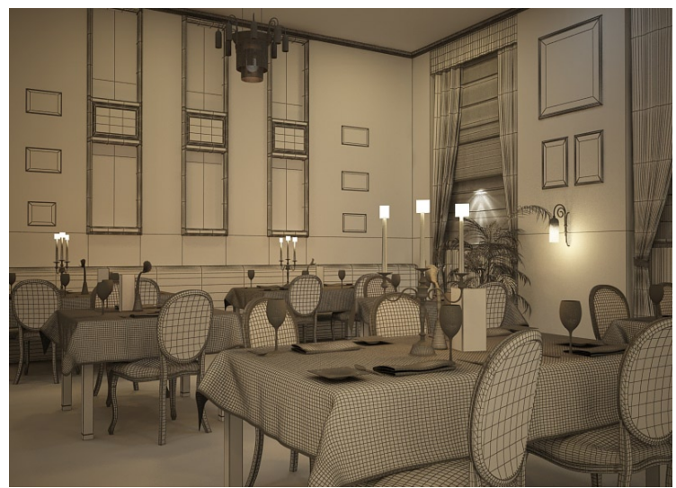
– 09 –