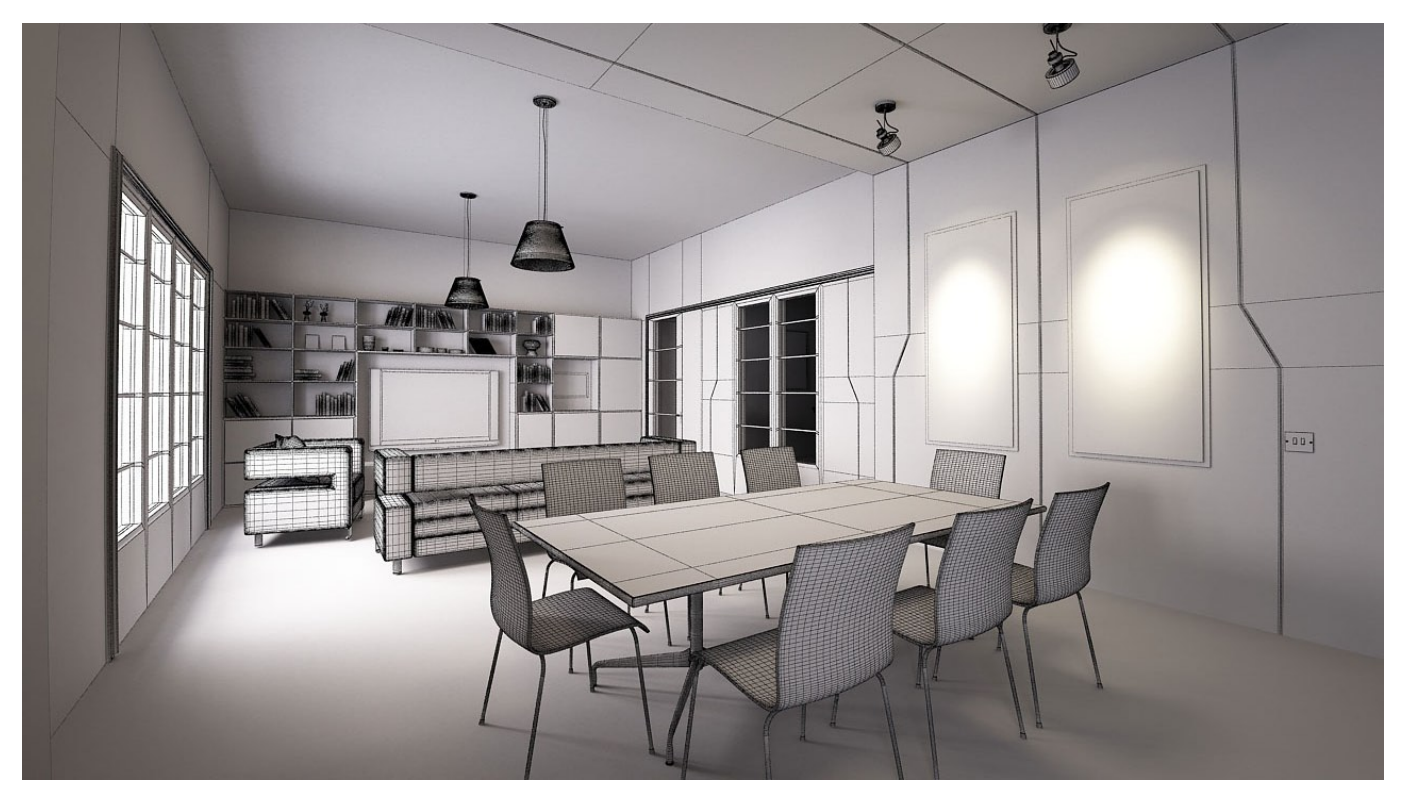
- 03 -