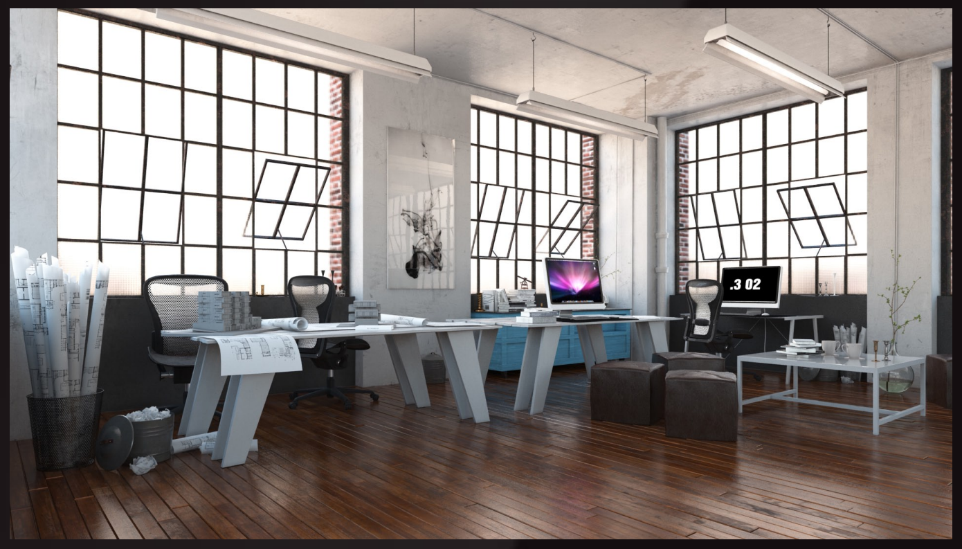
scene 05 raw

Have you ever wanted to make professional interior renderings? Do you know how to use VRaySun, VRaySky and VRayPhisicalCamera? Have you ever had problems with composition? Archexteriors will end all your problems. Take a look at this 10 fully textured scenes with professional shaders and lighting ready to render. Get your own portfolio and join cg market.