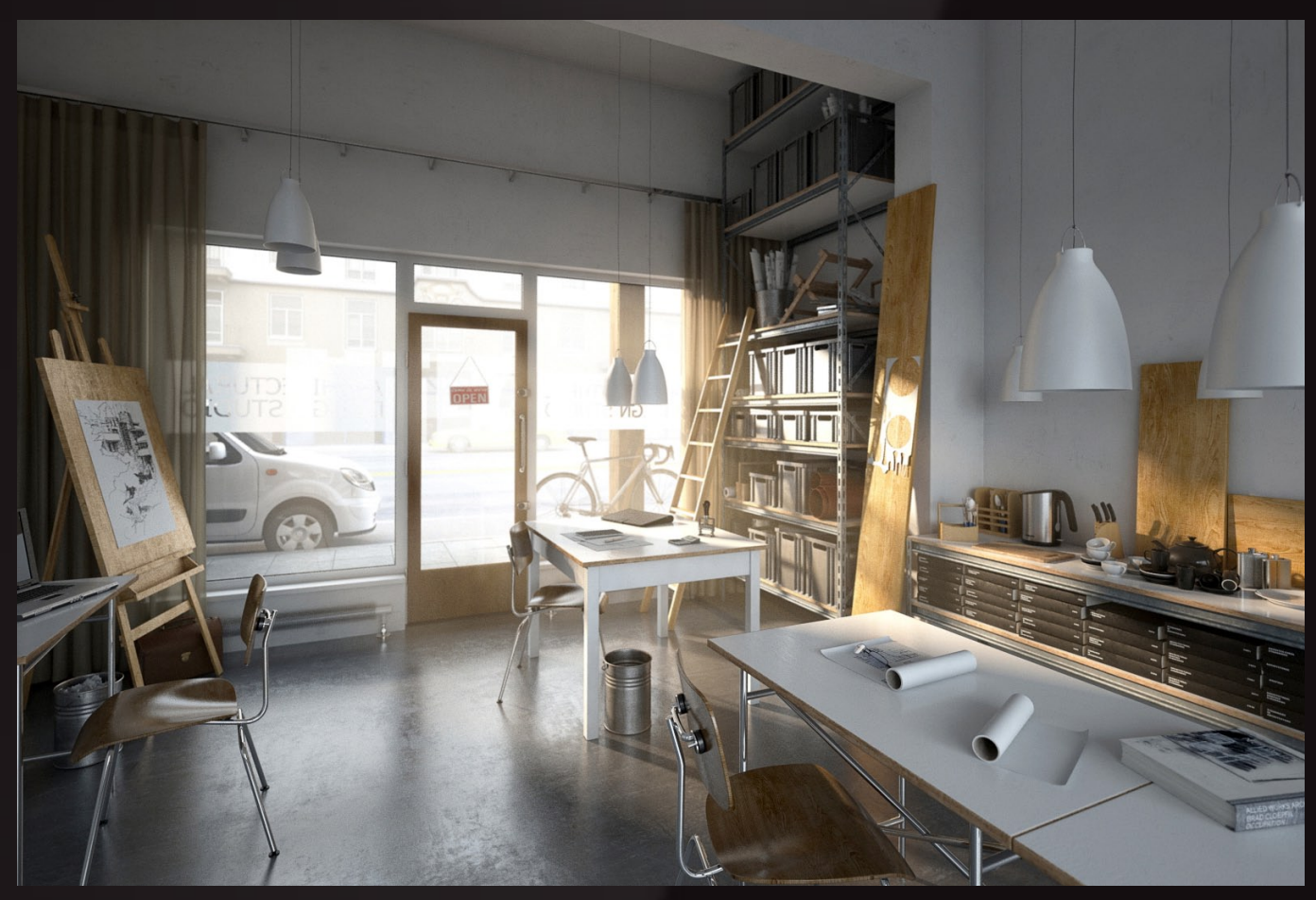
scene 06 post production

Have you ever wanted to make professional interior renderings? Do you know how to use VRaySun, VRaySky and VRayPhisicalCamera? Have you ever had problems with composition? Archexteriors will end all your problems. Take a look at this 10 fully textured scenes with professional shaders and lighting ready to render. Get your own portfolio and join cg market.