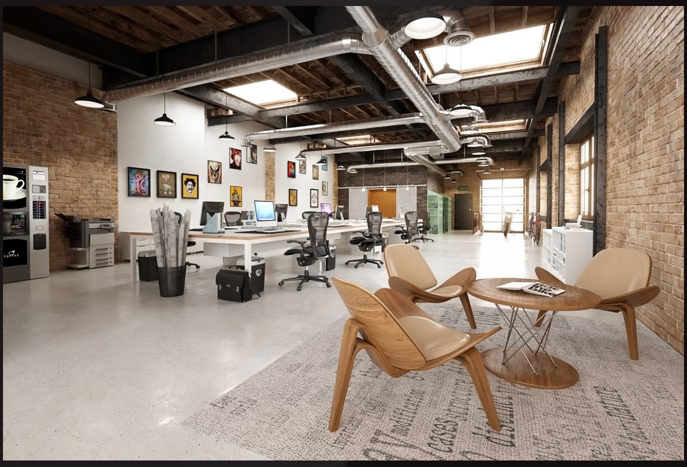
scene 08 post production

Have you ever wanted to make professional interior renderings? Do you know how to use VRaySun, VRaySky and VRayPhisicalCamera? Have you ever had problems with composition? Archexteriors will end all your problems. Take a look at this 10 fully textured scenes with professional shaders and lighting ready to render. Get your own portfolio and join cg market.