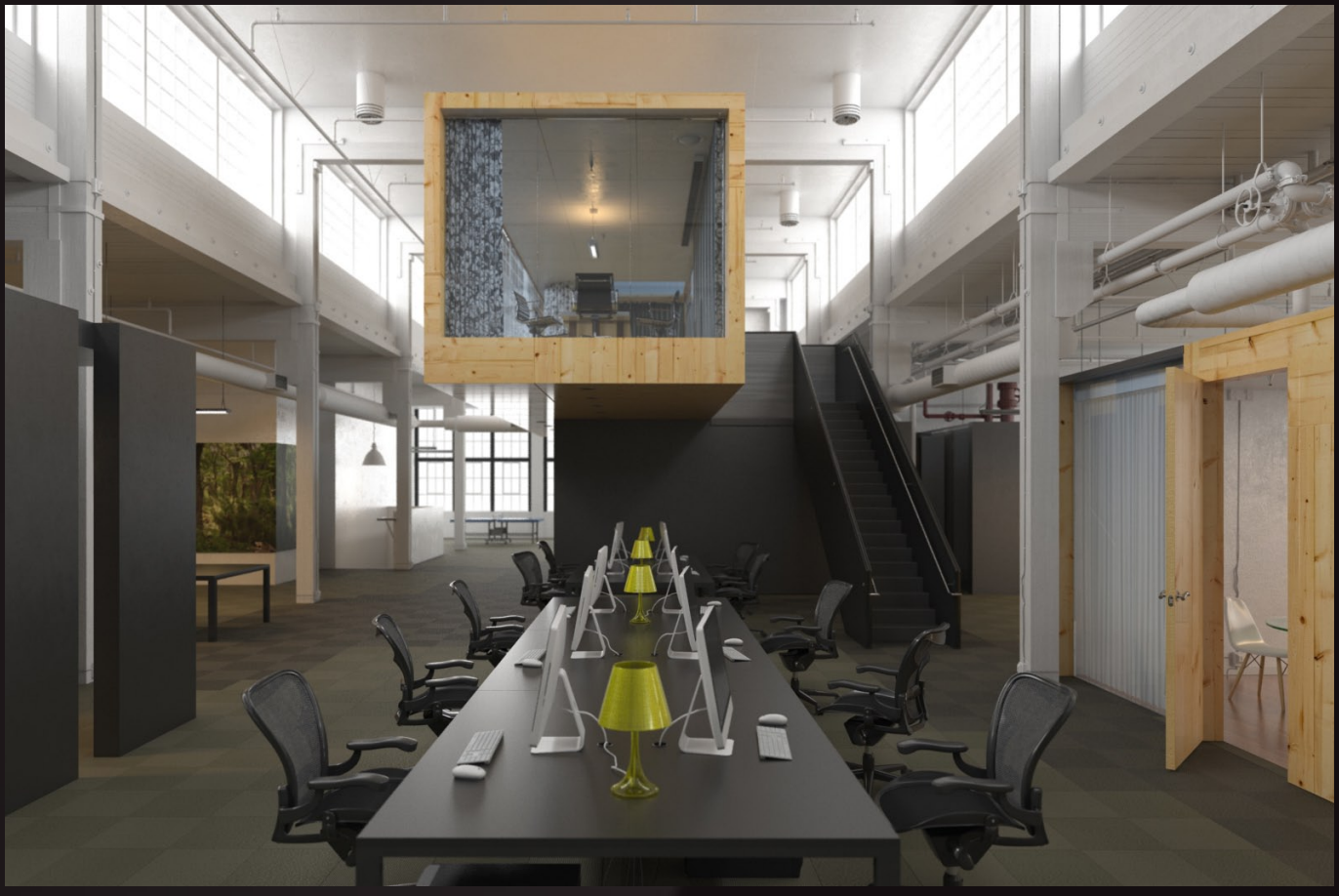
scene 07 raw

Have you ever wanted to make professional interior renderings? Do you know how to use VRaySun, VRaySky and VRayPhisicalCamera? Have you ever had problems with composition? Archexteriors will end all your problems. Take a look at this 10 fully textured scenes with professional shaders and lighting ready to render. Get your own portfolio and join cg market.