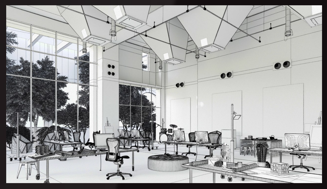
scene 10 wire