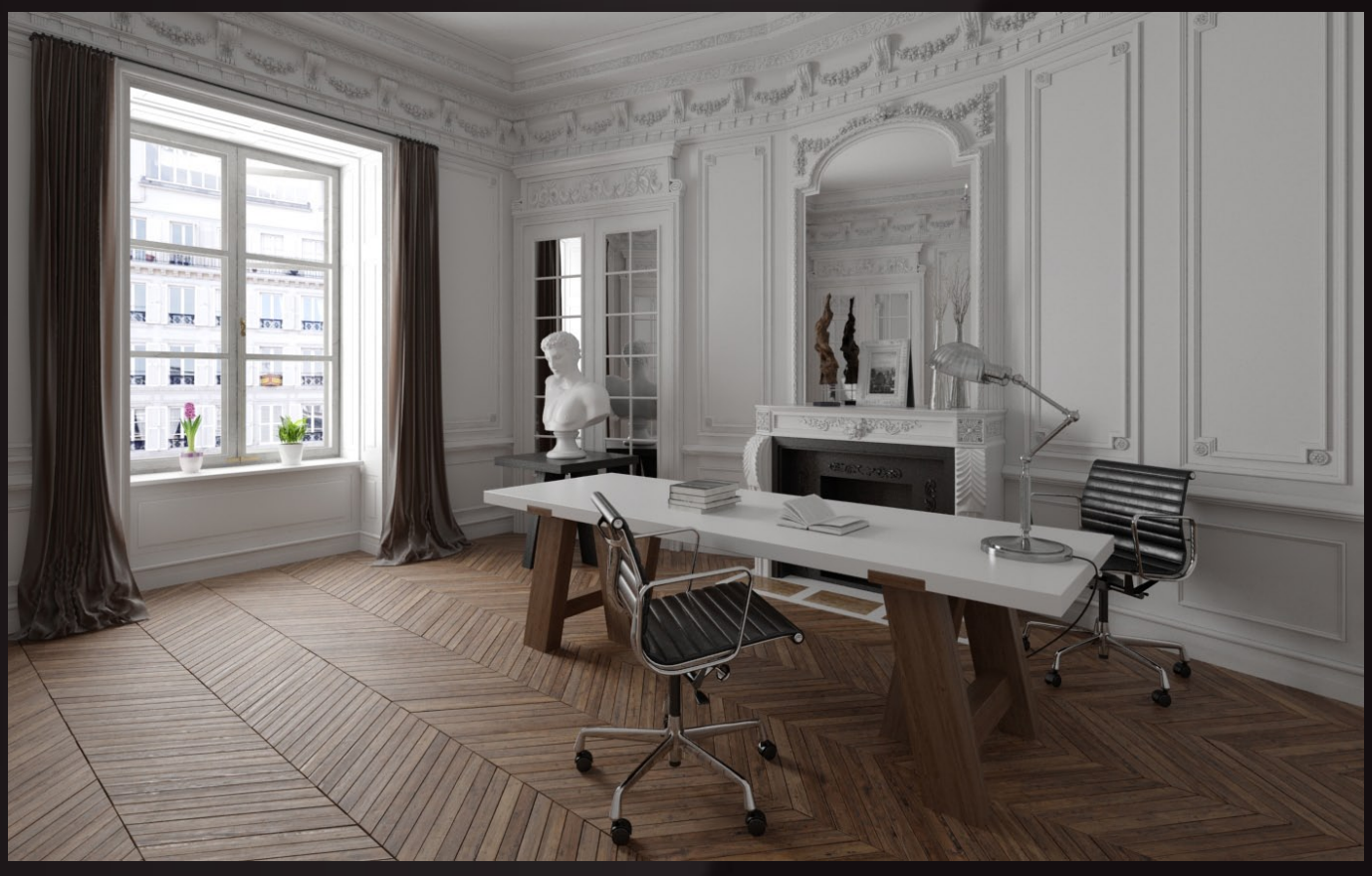
scene 04 raw

Have you ever wanted to make professional interior renderings? Do you know how to use VRaySun, VRaySky and VRayPhisicalCamera? Have you ever had problems with composition? Archexteriors will end all your problems. Take a look at this 10 fully textured scenes with professional shaders and lighting ready to render. Get your own portfolio and join cg market.