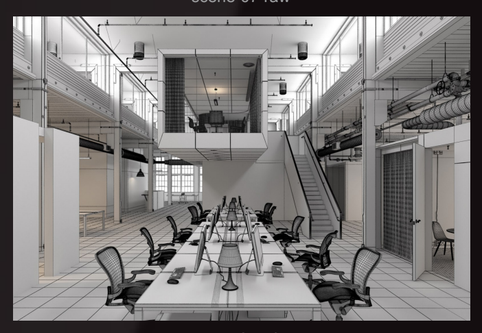
scene 07 wire