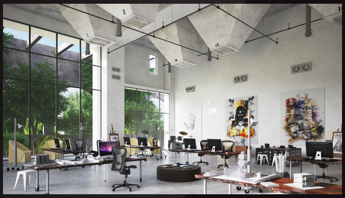
scene 10 raw

Have you ever wanted to make professional interior renderings? Do you know how to use VRaySun, VRaySky and VRayPhisicalCamera? Have you ever had problems with composition? Archexteriors will end all your problems. Take a look at this 10 fully textured scenes with professional shaders and lighting ready to render. Get your own portfolio and join cg market.