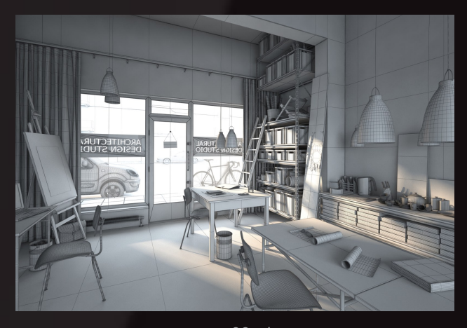
scene 06 wire