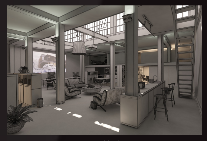
scene 09 wire