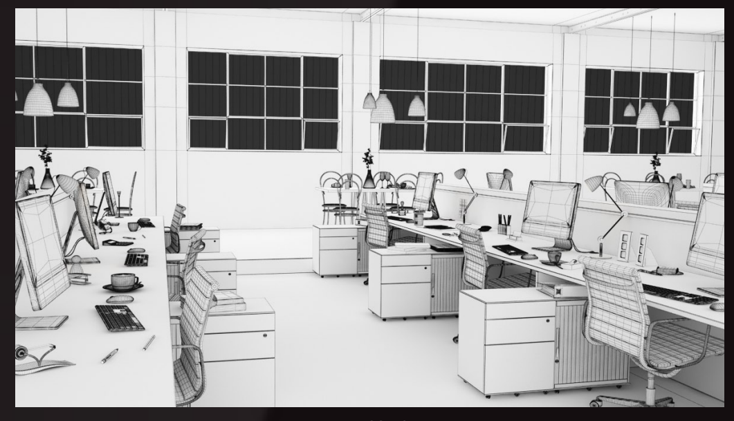
scene 02 wire