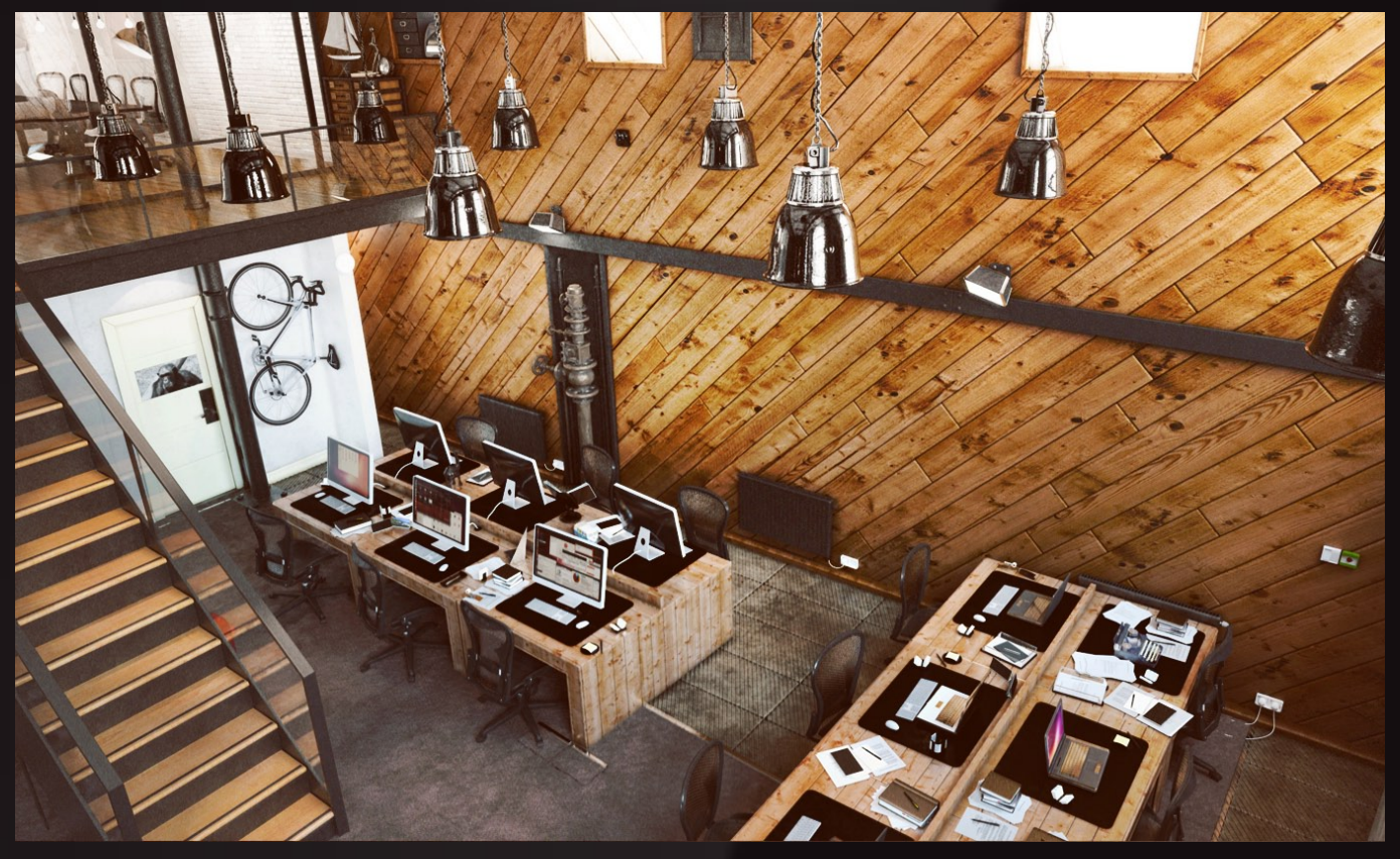
scene 01 post production

Have you ever wanted to make professional interior renderings? Do you know how to use VRaySun, VRaySky and VRayPhisicalCamera? Have you ever had problems with composition? Archexteriors will end all your problems. Take a look at this 10 fully textured scenes with professional shaders and lighting ready to render. Get your own portfolio and join cg market.