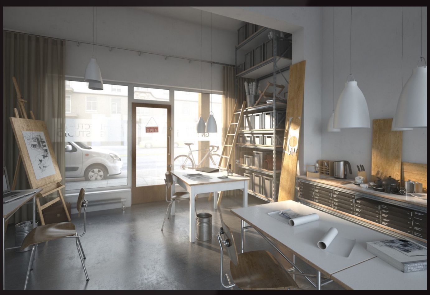
scene 06 raw

Have you ever wanted to make professional interior renderings? Do you know how to use VRaySun, VRaySky and VRayPhisicalCamera? Have you ever had problems with composition? Archexteriors will end all your problems. Take a look at this 10 fully textured scenes with professional shaders and lighting ready to render. Get your own portfolio and join cg market.