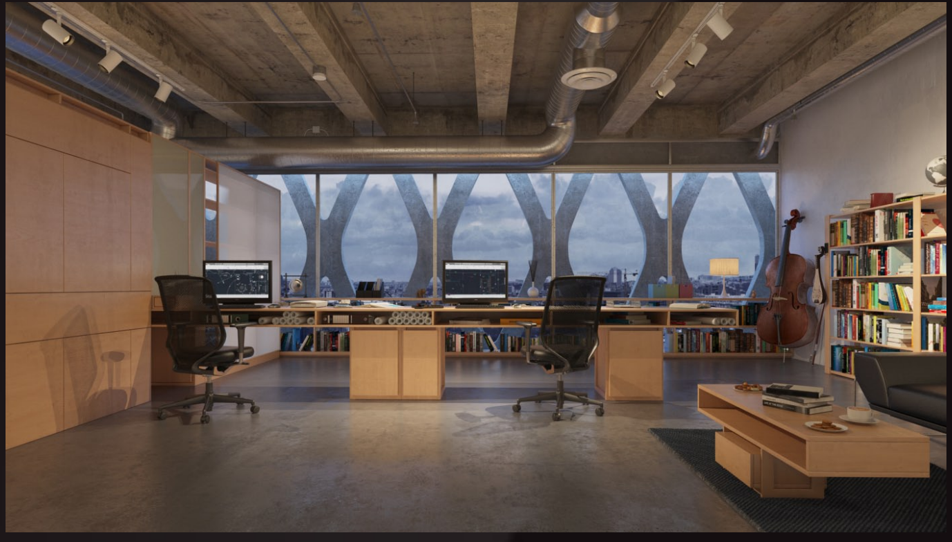
scene 03 raw

Have you ever wanted to make professional interior renderings? Do you know how to use VRaySun, VRaySky and VRayPhisicalCamera? Have you ever had problems with composition? Archexteriors will end all your problems. Take a look at this 10 fully textured scenes with professional shaders and lighting ready to render. Get your own portfolio and join cg market.