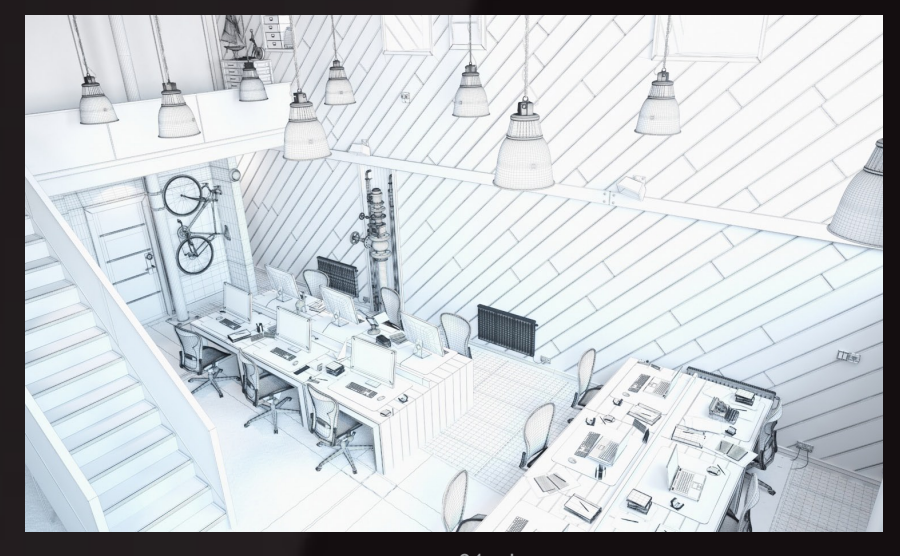
scene 01 wire