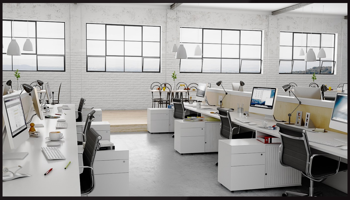
scene 02 post production

Have you ever wanted to make professional interior renderings? Do you know how to use VRaySun, VRaySky and VRayPhisicalCamera? Have you ever had problems with composition? Archexteriors will end all your problems. Take a look at this 10 fully textured scenes with professional shaders and lighting ready to render. Get your own portfolio and join cg market.