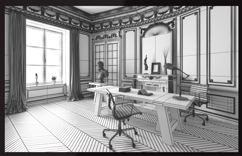
scene 04 wire