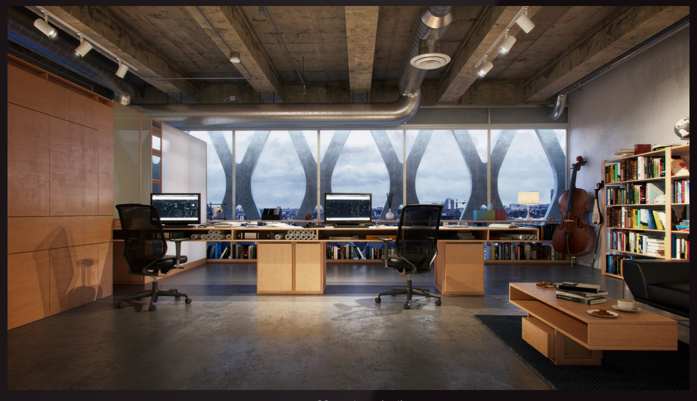
scene 03 post production

Have you ever wanted to make professional interior renderings? Do you know how to use VRaySun, VRaySky and VRayPhisicalCamera? Have you ever had problems with composition? Archexteriors will end all your problems. Take a look at this 10 fully textured scenes with professional shaders and lighting ready to render. Get your own portfolio and join cg market.