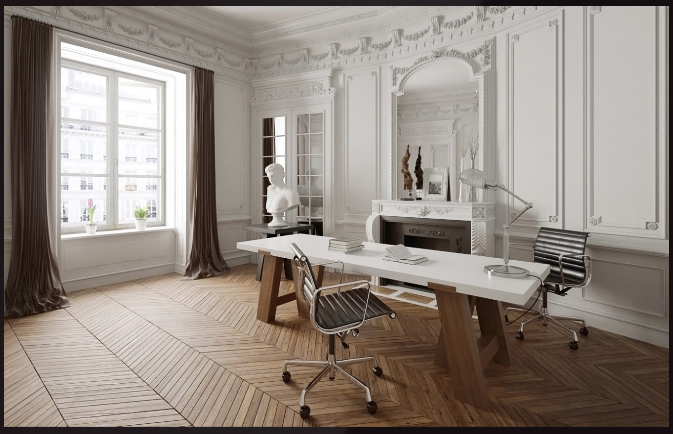
scene 04 post production

Have you ever wanted to make professional interior renderings? Do you know how to use VRaySun, VRaySky and VRayPhisicalCamera? Have you ever had problems with composition? Archexteriors will end all your problems. Take a look at this 10 fully textured scenes with professional shaders and lighting ready to render. Get your own portfolio and join cg market.