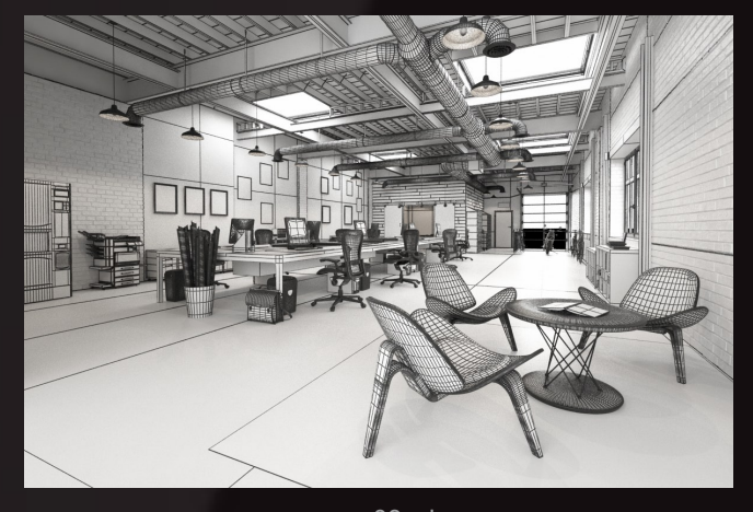
scene 08 wire