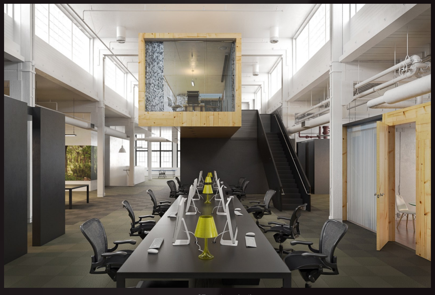
scene 07 post production

Have you ever wanted to make professional interior renderings? Do you know how to use VRaySun, VRaySky and VRayPhisicalCamera? Have you ever had problems with composition? Archexteriors will end all your problems. Take a look at this 10 fully textured scenes with professional shaders and lighting ready to render. Get your own portfolio and join cg market.