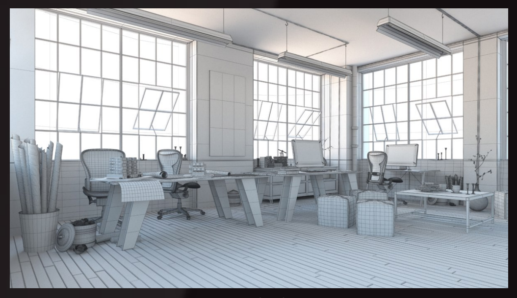
scene 05 wire