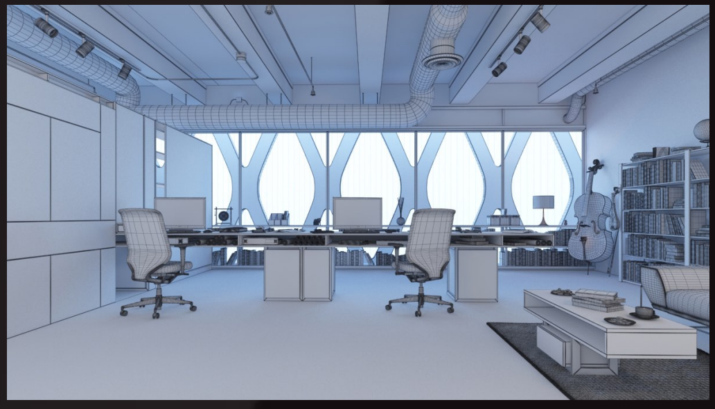
scene 03 wire