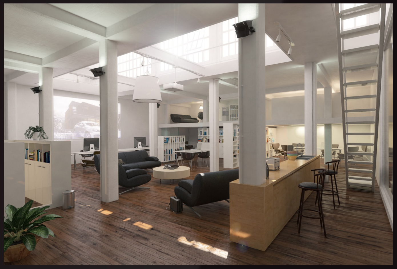
scene 09 post production

Have you ever wanted to make professional interior renderings? Do you know how to use VRaySun, VRaySky and VRayPhisicalCamera? Have you ever had problems with composition? Archexteriors will end all your problems. Take a look at this 10 fully textured scenes with professional shaders and lighting ready to render. Get your own portfolio and join cg market.