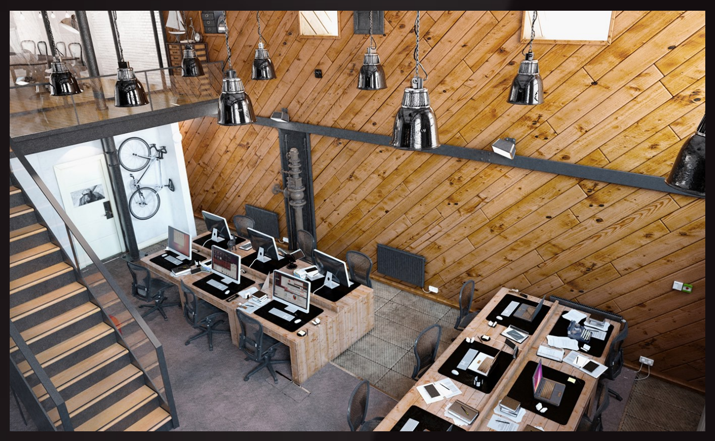
scene 01 raw

Have you ever wanted to make professional interior renderings? Do you know how to use VRaySun, VRaySky and VRayPhisicalCamera? Have you ever had problems with composition? Archexteriors will end all your problems. Take a look at this 10 fully textured scenes with professional shaders and lighting ready to render. Get your own portfolio and join cg market.