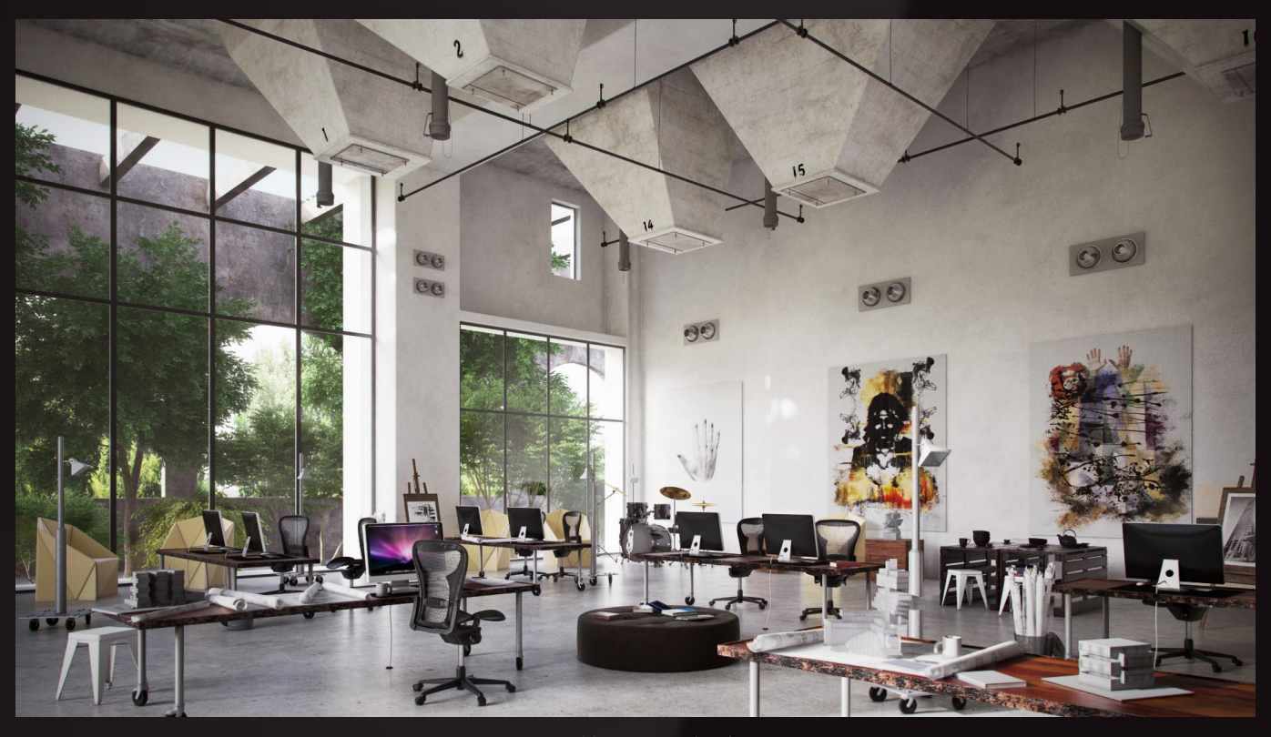
scene 10 post production

Have you ever wanted to make professional interior renderings? Do you know how to use VRaySun, VRaySky and VRayPhisicalCamera? Have you ever had problems with composition? Archexteriors will end all your problems. Take a look at this 10 fully textured scenes with professional shaders and lighting ready to render. Get your own portfolio and join cg market.