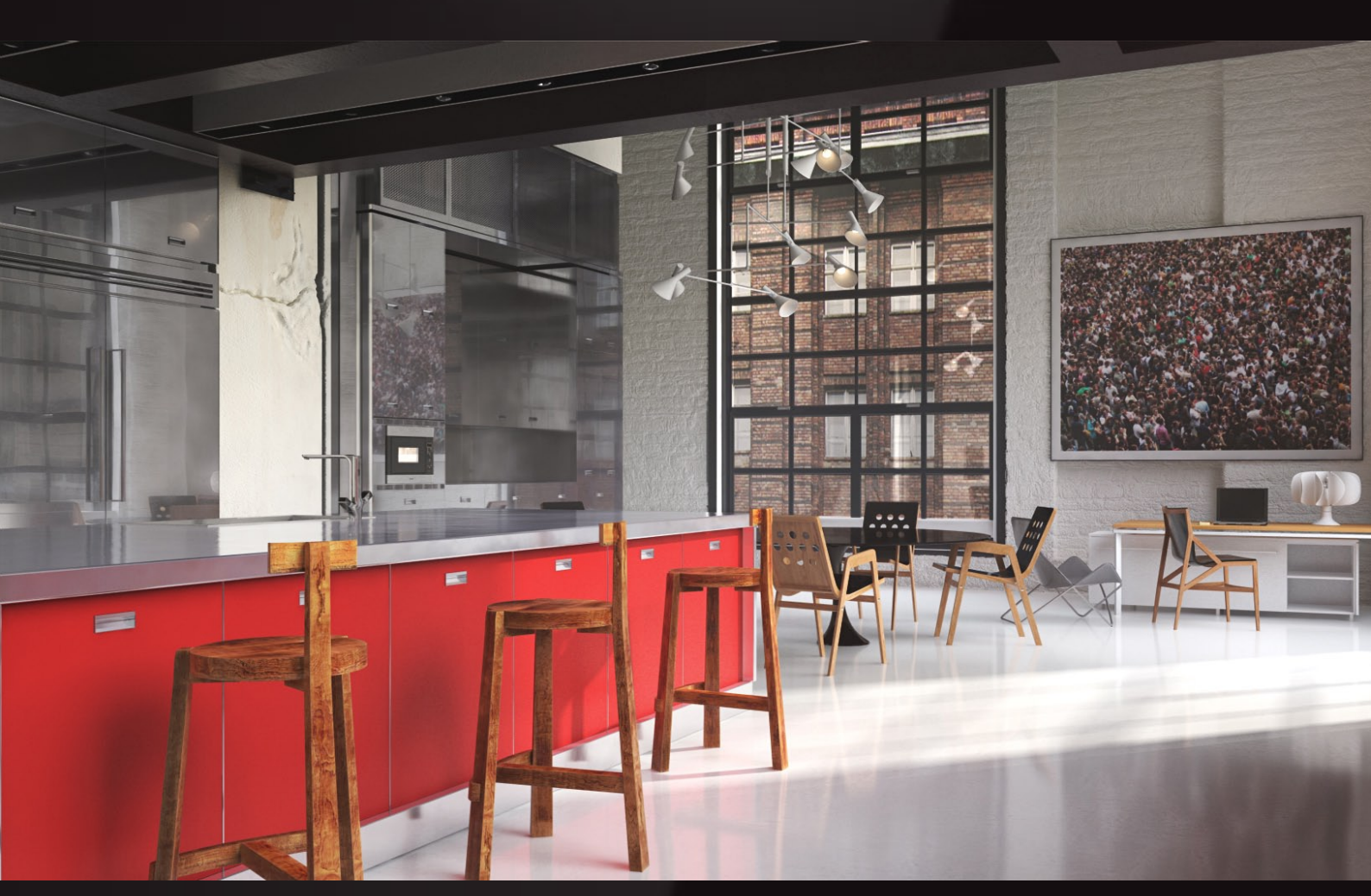
scene 04 cam 01 post production

Have you ever wanted to make professional interior renderings? Do you know how to use VRaySun, VRaySky and VRayPhisicalCamera? Have you ever had problems with composition? Archexteriors will end all your problems. Take a look at this 10 fully textured scenes with professional shaders and lighting ready to render. Get your own portfolio and join cg market.