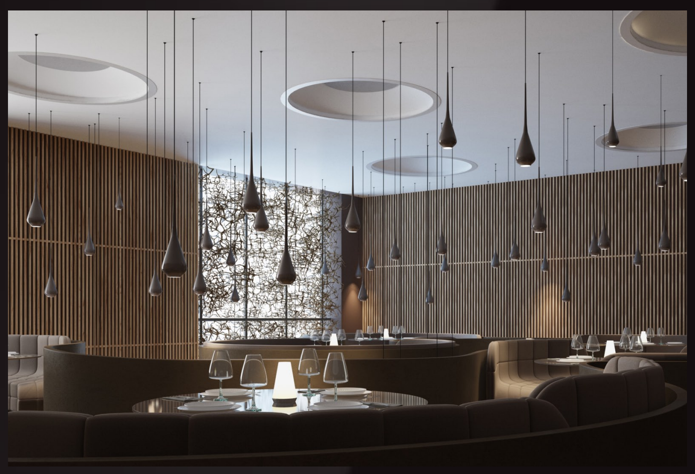
scene 03 cam 02 raw

Have you ever wanted to make professional interior renderings? Do you know how to use VRaySun, VRaySky and VRayPhisicalCamera? Have you ever had problems with composition? Archexteriors will end all your problems. Take a look at this 10 fully textured scenes with professional shaders and lighting ready to render. Get your own portfolio and join cg market.