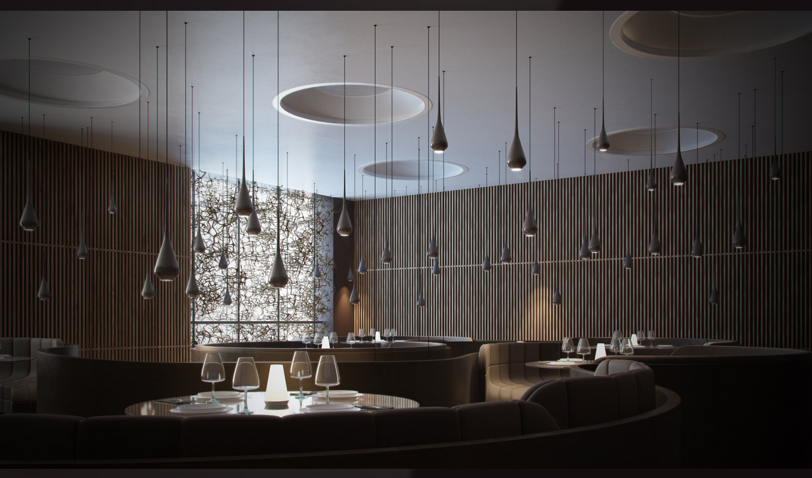
scene 03 cam 02 post production

Have you ever wanted to make professional interior renderings? Do you know how to use VRaySun, VRaySky and VRayPhisicalCamera? Have you ever had problems with composition? Archexteriors will end all your problems. Take a look at this 10 fully textured scenes with professional shaders and lighting ready to render. Get your own portfolio and join cg market.