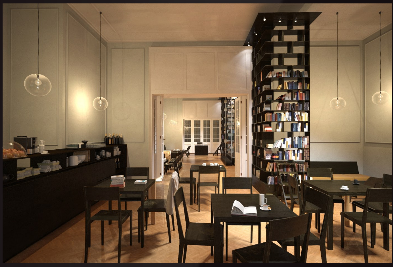
scene 02 cam 01 raw

Have you ever wanted to make professional interior renderings? Do you know how to use VRaySun, VRaySky and VRayPhisicalCamera? Have you ever had problems with composition? Archexteriors will end all your problems. Take a look at this 10 fully textured scenes with professional shaders and lighting ready to render. Get your own portfolio and join cg market.