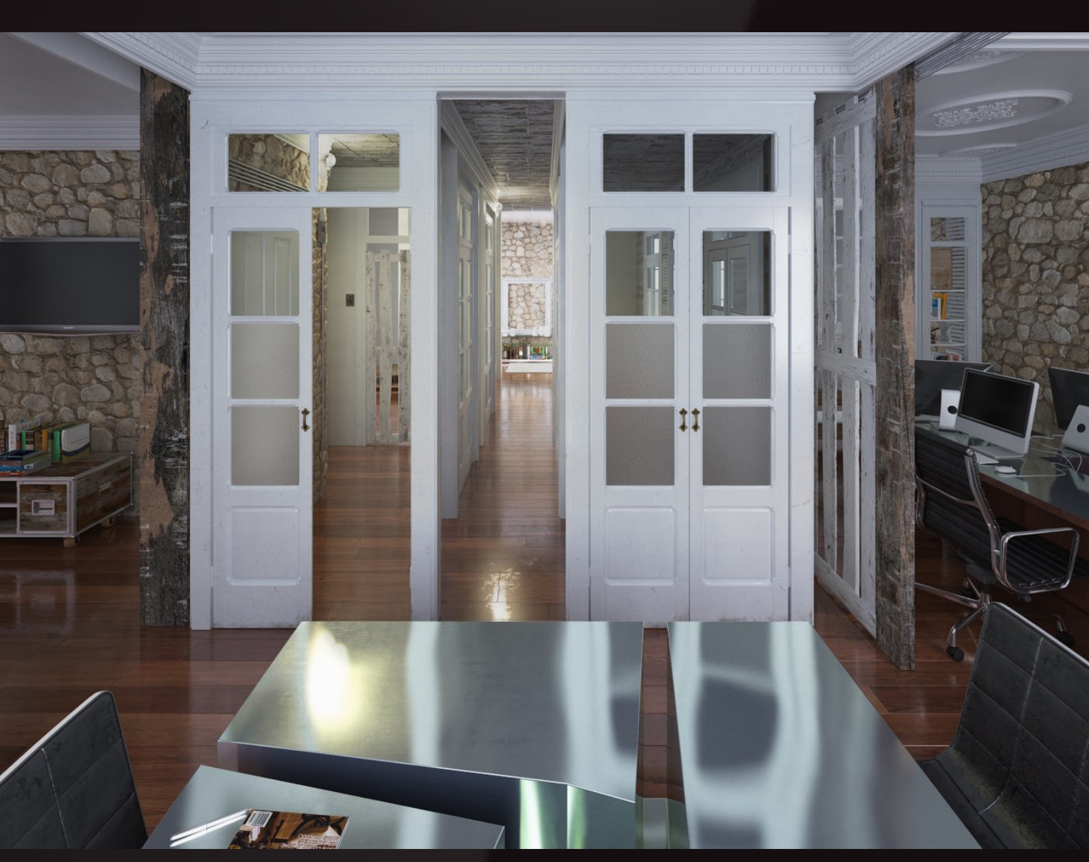
scene 01 cam 02 post production

Have you ever wanted to make professional interior renderings? Do you know how to use VRaySun, VRaySky and VRayPhisicalCamera? Have you ever had problems with composition? Archexteriors will end all your problems. Take a look at this 10 fully textured scenes with professional shaders and lighting ready to render. Get your own portfolio and join cg market.