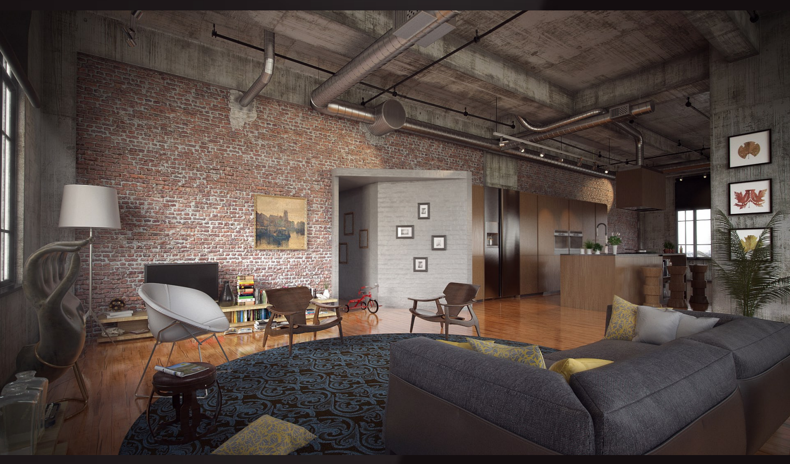
scene 05 cam 01 post production

Have you ever wanted to make professional interior renderings? Do you know how to use VRaySun, VRaySky and VRayPhisicalCamera? Have you ever had problems with composition? Archexteriors will end all your problems. Take a look at this 10 fully textured scenes with professional shaders and lighting ready to render. Get your own portfolio and join cg market.