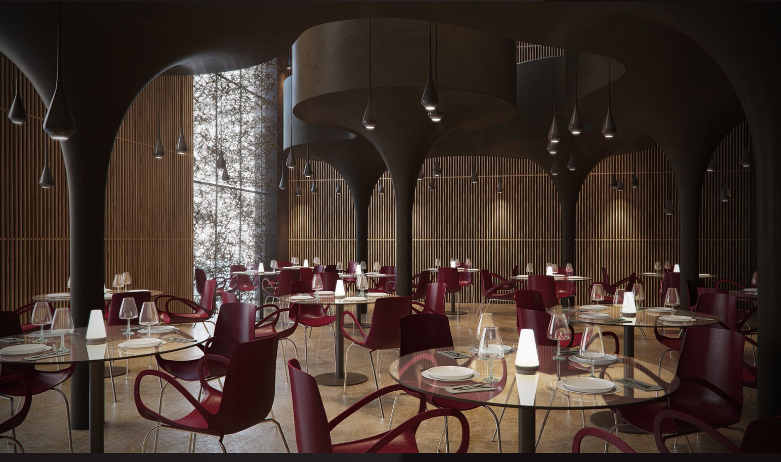
scene 03 cam 01 post production

Have you ever wanted to make professional interior renderings? Do you know how to use VRaySun, VRaySky and VRayPhisicalCamera? Have you ever had problems with composition? Archexteriors will end all your problems. Take a look at this 10 fully textured scenes with professional shaders and lighting ready to render. Get your own portfolio and join cg market.