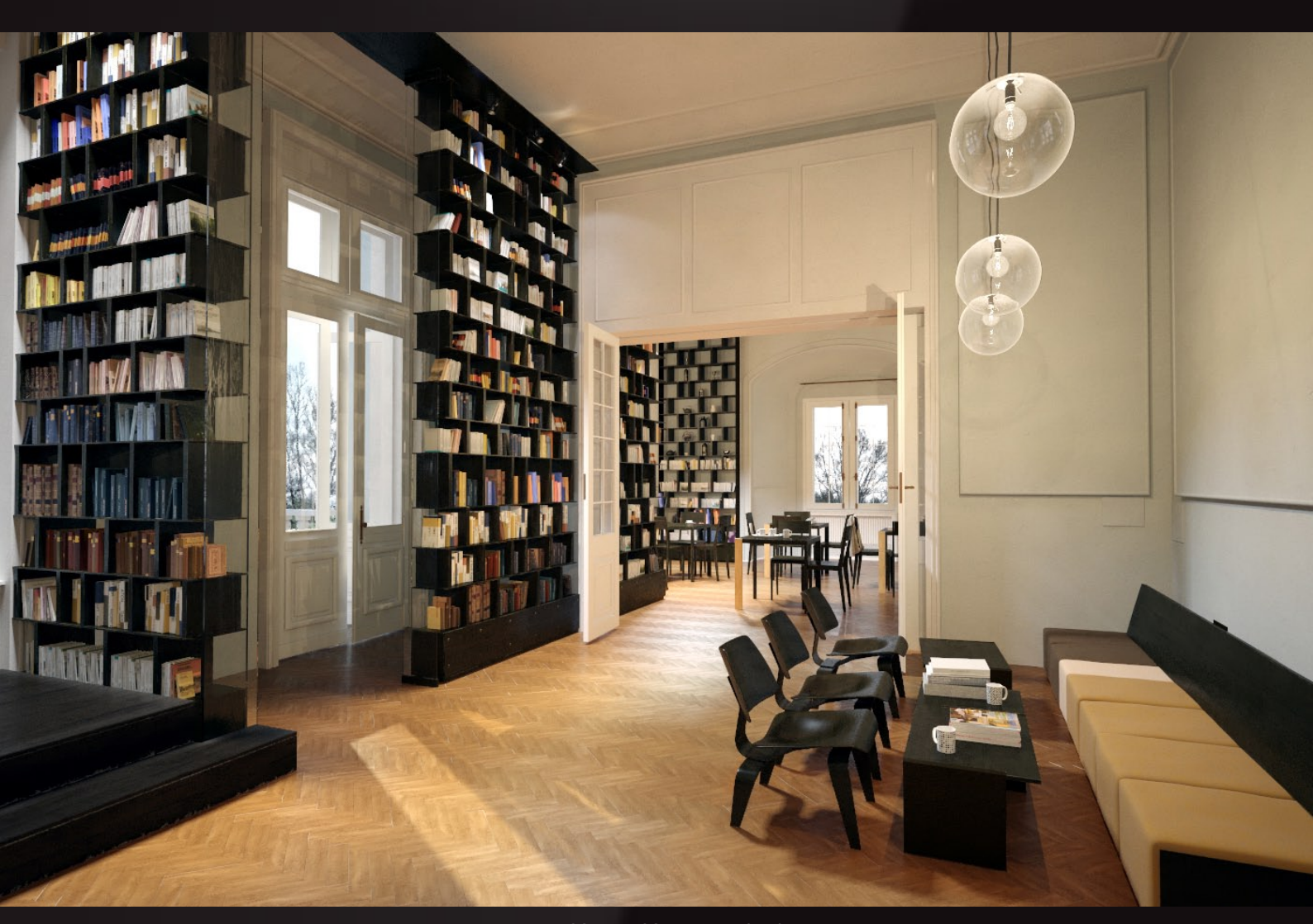
scene 02 cam 02 post production

Have you ever wanted to make professional interior renderings? Do you know how to use VRaySun, VRaySky and VRayPhisicalCamera? Have you ever had problems with composition? Archexteriors will end all your problems. Take a look at this 10 fully textured scenes with professional shaders and lighting ready to render. Get your own portfolio and join cg market.