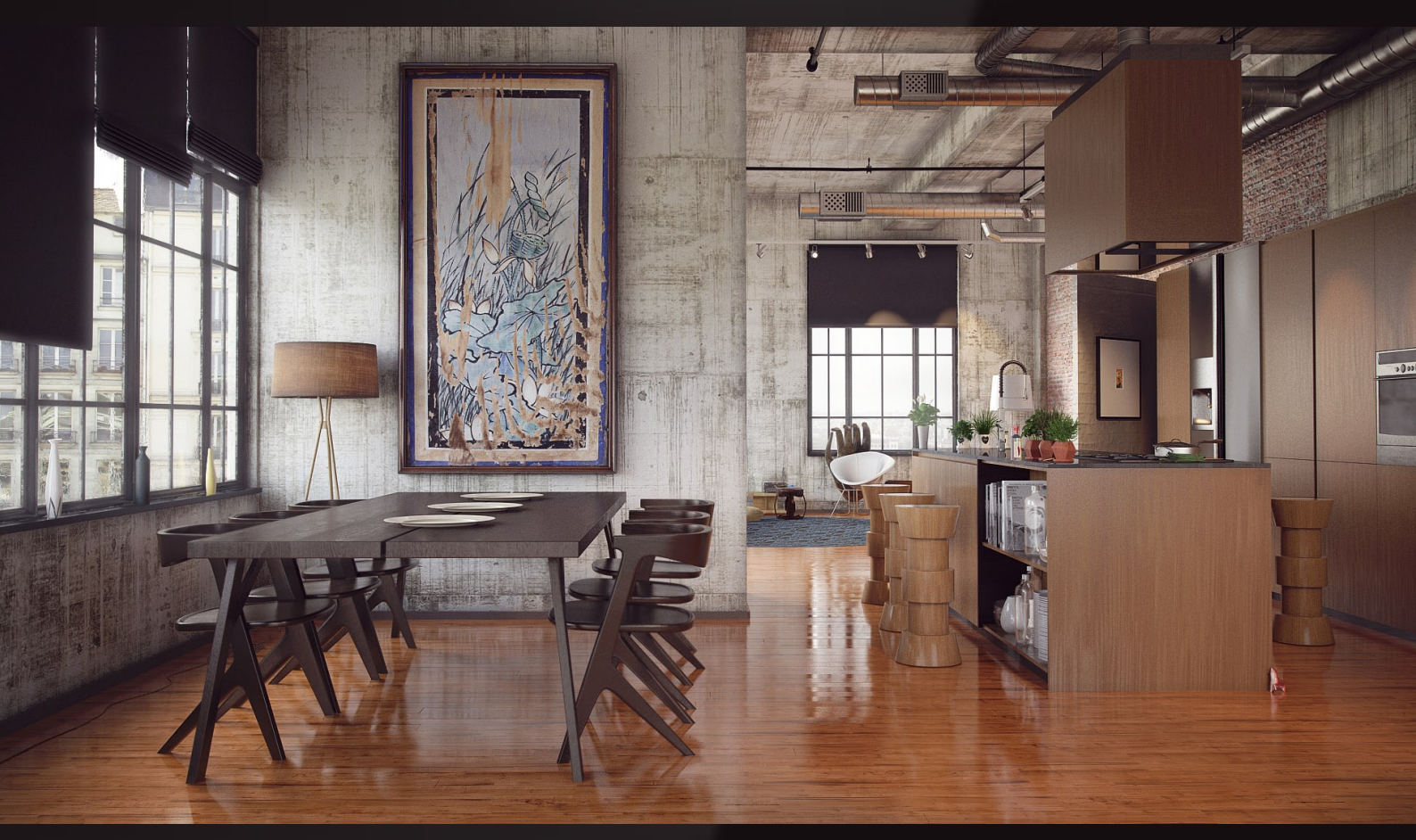
scene 05 cam 02 post production

Have you ever wanted to make professional interior renderings? Do you know how to use VRaySun, VRaySky and VRayPhisicalCamera? Have you ever had problems with composition? Archexteriors will end all your problems. Take a look at this 10 fully textured scenes with professional shaders and lighting ready to render. Get your own portfolio and join cg market.