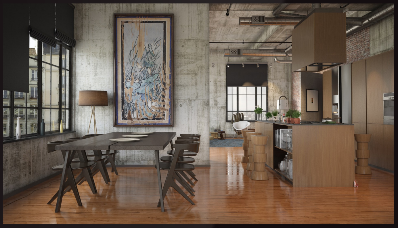
scene 05 cam 02 raw

Have you ever wanted to make professional interior renderings? Do you know how to use VRaySun, VRaySky and VRayPhisicalCamera? Have you ever had problems with composition? Archexteriors will end all your problems. Take a look at this 10 fully textured scenes with professional shaders and lighting ready to render. Get your own portfolio and join cg market.