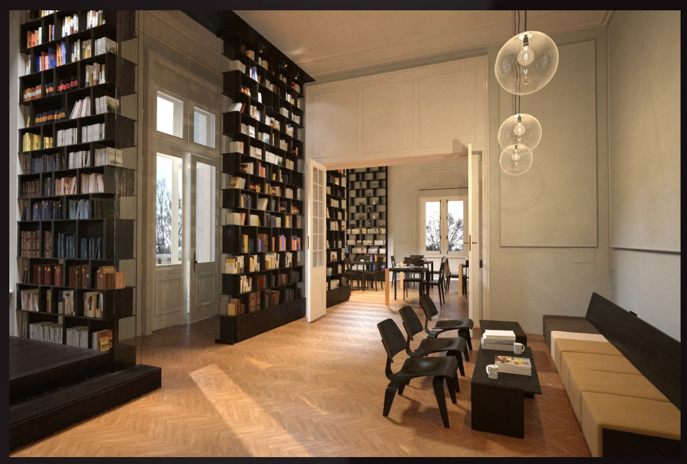
scene 02 cam 02 raw

Have you ever wanted to make professional interior renderings? Do you know how to use VRaySun, VRaySky and VRayPhisicalCamera? Have you ever had problems with composition? Archexteriors will end all your problems. Take a look at this 10 fully textured scenes with professional shaders and lighting ready to render. Get your own portfolio and join cg market.