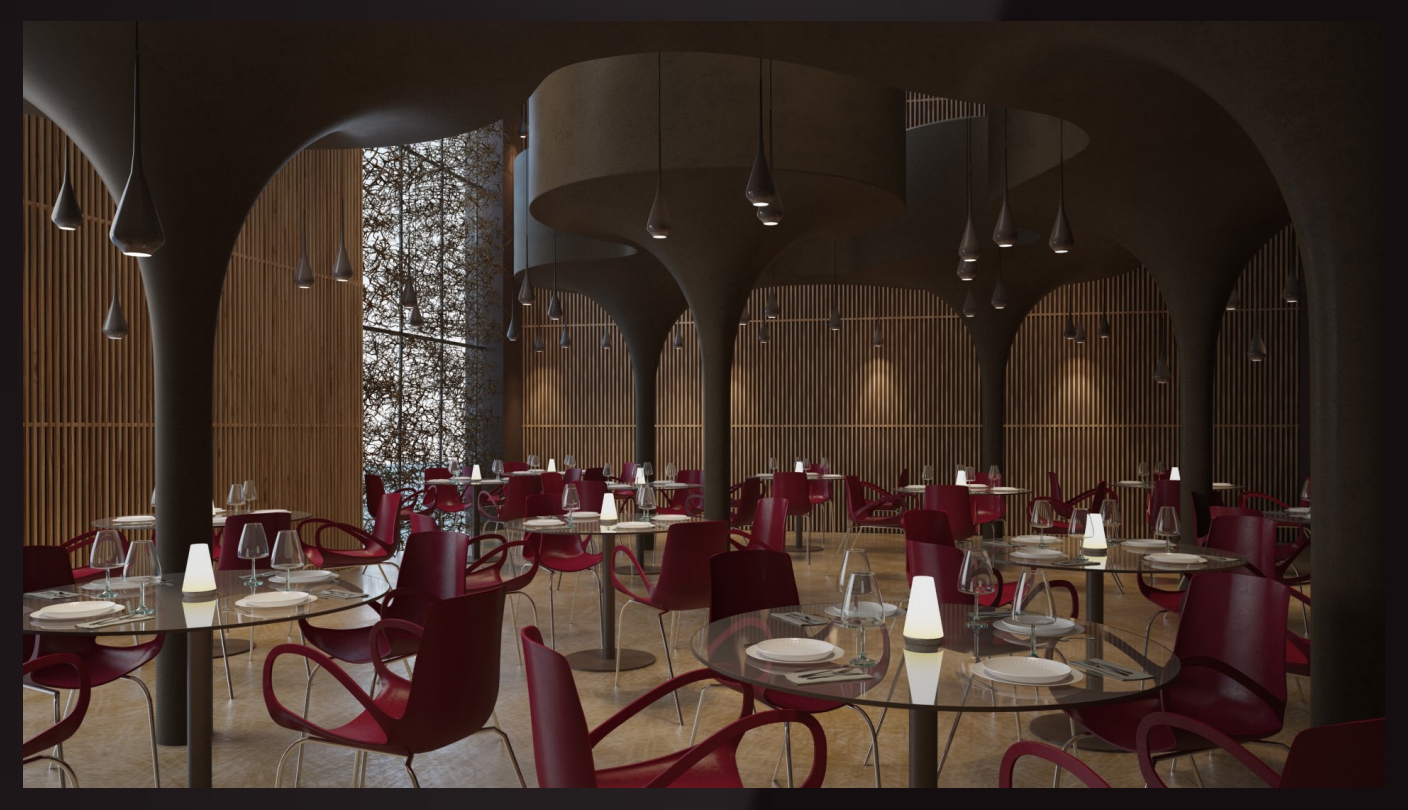
scene 03 cam 01 raw

Have you ever wanted to make professional interior renderings? Do you know how to use VRaySun, VRaySky and VRayPhisicalCamera? Have you ever had problems with composition? Archexteriors will end all your problems. Take a look at this 10 fully textured scenes with professional shaders and lighting ready to render. Get your own portfolio and join cg market.