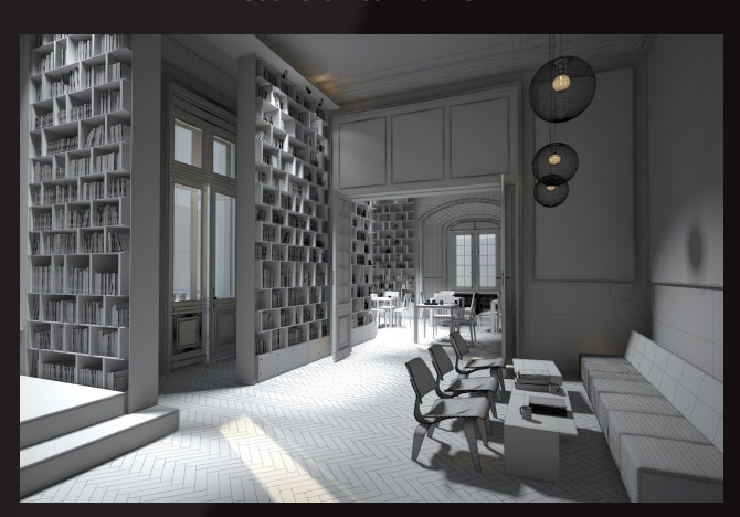
scene 02 cam 02 wire