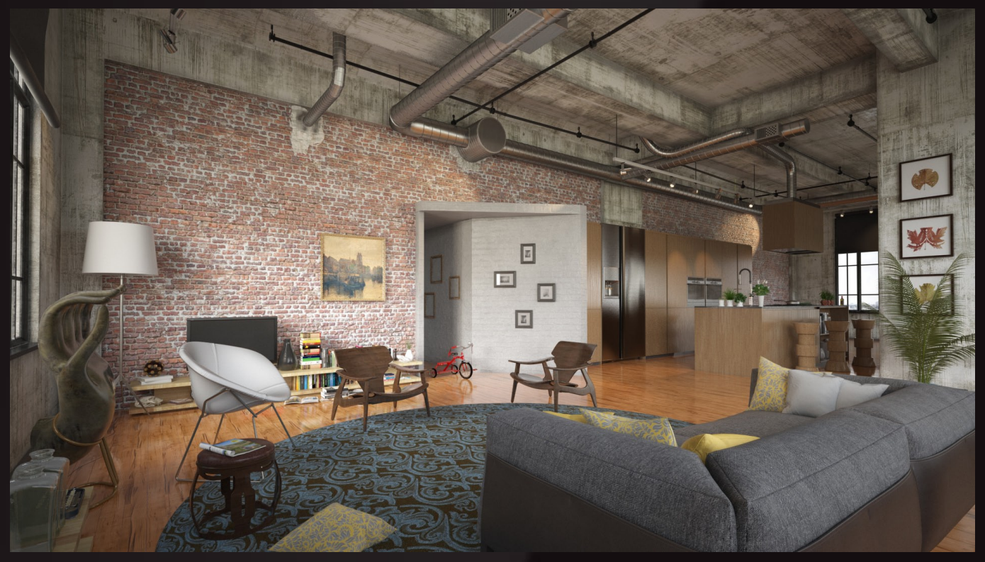
scene 05 cam 01 raw

Have you ever wanted to make professional interior renderings? Do you know how to use VRaySun, VRaySky and VRayPhisicalCamera? Have you ever had problems with composition? Archexteriors will end all your problems. Take a look at this 10 fully textured scenes with professional shaders and lighting ready to render. Get your own portfolio and join cg market.