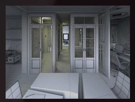
scene 01 cam 02 wire