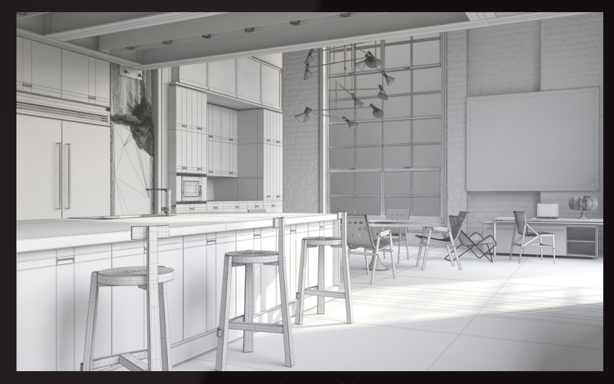
scene 04 cam 01 wire