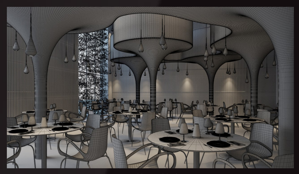
scene 03 cam 01 wire