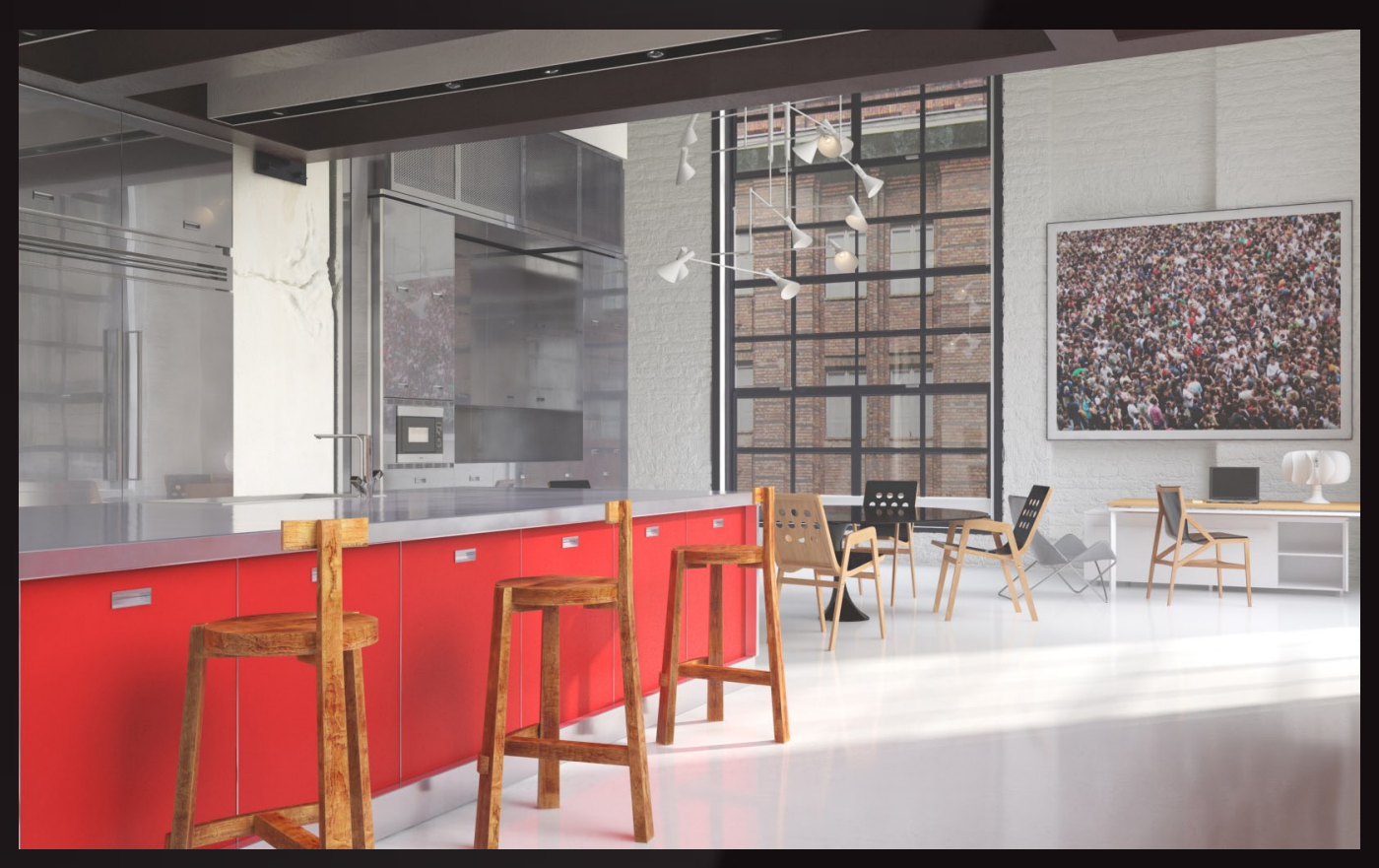
scene 04 cam 01 raw

Have you ever wanted to make professional interior renderings? Do you know how to use VRaySun, VRaySky and VRayPhisicalCamera? Have you ever had problems with composition? Archexteriors will end all your problems. Take a look at this 10 fully textured scenes with professional shaders and lighting ready to render. Get your own portfolio and join cg market.