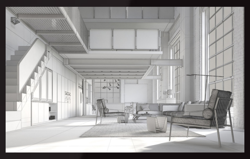
scene 04 cam 02 wire