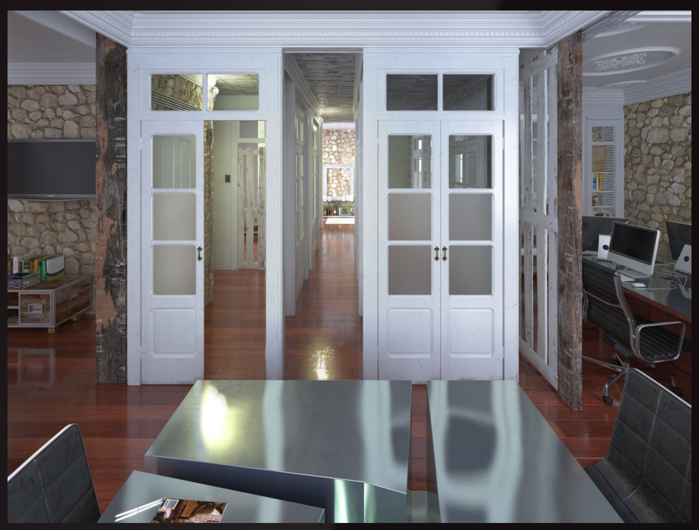
scene 01 cam 02 raw

Have you ever wanted to make professional interior renderings? Do you know how to use VRaySun, VRaySky and VRayPhisicalCamera? Have you ever had problems with composition? Archexteriors will end all your problems. Take a look at this 10 fully textured scenes with professional shaders and lighting ready to render. Get your own portfolio and join cg market.