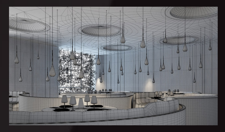
scene 03 cam 02 wire