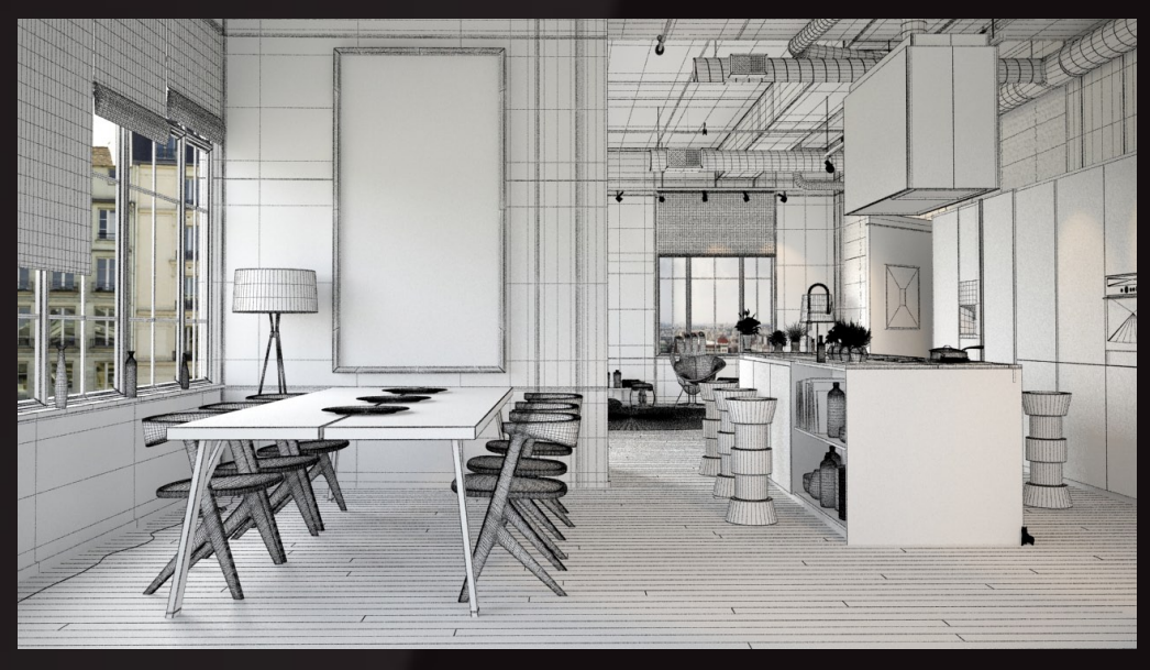
scene 05 cam 02 wire