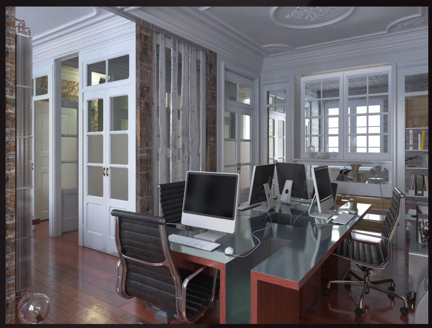
scene 01 cam 01 raw

Have you ever wanted to make professional interior renderings? Do you know how to use VRaySun, VRaySky and VRayPhisicalCamera? Have you ever had problems with composition? Archexteriors will end all your problems. Take a look at this 10 fully textured scenes with professional shaders and lighting ready to render. Get your own portfolio and join cg market.