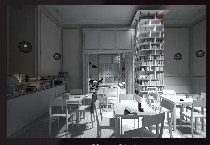
scene 02 cam 01 wire