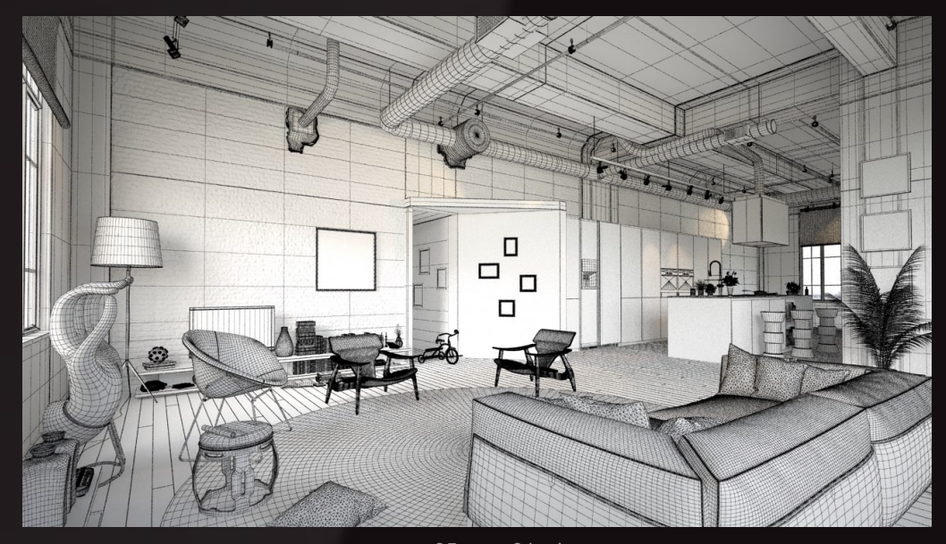
scene 05 cam 01 wire