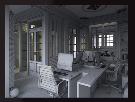
scene 01 wire