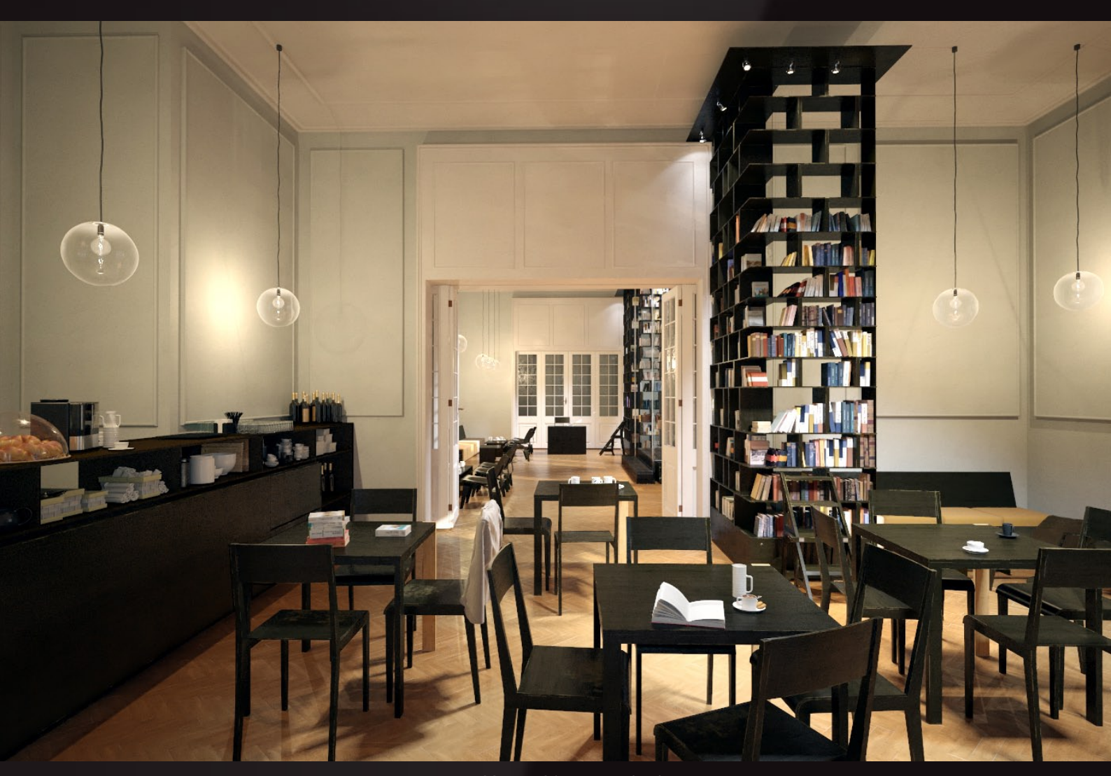
scene 02 cam 01 post production

Have you ever wanted to make professional interior renderings? Do you know how to use VRaySun, VRaySky and VRayPhisicalCamera? Have you ever had problems with composition? Archexteriors will end all your problems. Take a look at this 10 fully textured scenes with professional shaders and lighting ready to render. Get your own portfolio and join cg market.