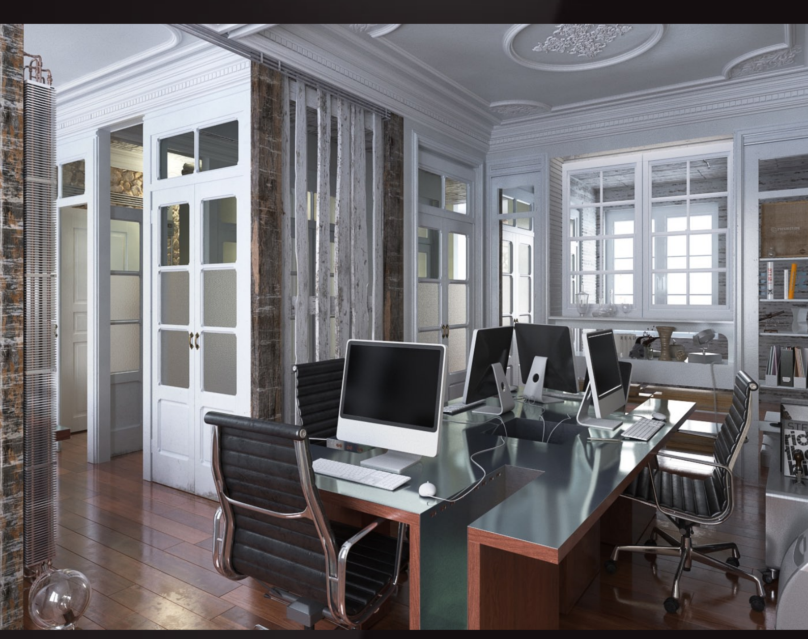
scene 01 cam 01 post production

Have you ever wanted to make professional interior renderings? Do you know how to use VRaySun, VRaySky and VRayPhisicalCamera? Have you ever had problems with composition? Archexteriors will end all your problems. Take a look at this 10 fully textured scenes with professional shaders and lighting ready to render. Get your own portfolio and join cg market.