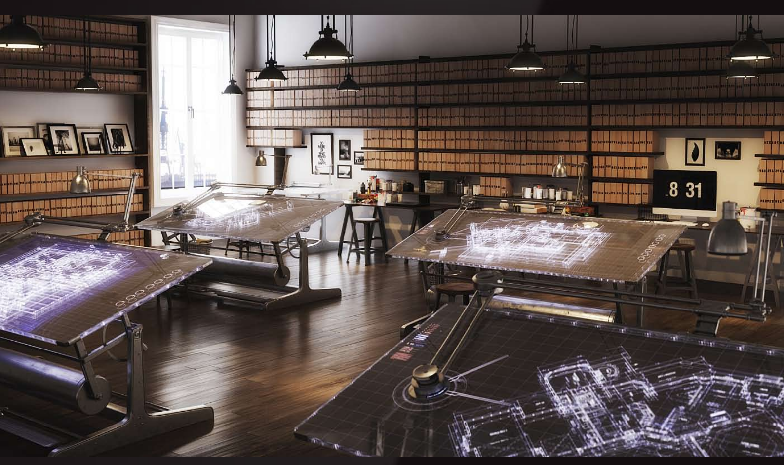
scene 03 post production

Have you ever wanted to make professional interior renderings? Do you know how to use VRaySun, VRaySky and VRayPhisicalCamera? Have you ever had problems with composition? Archexteriors will end all your problems. Take a look at this 10 fully textured scenes with professional shaders and lighting ready to render. Get your own portfolio and join cg market.