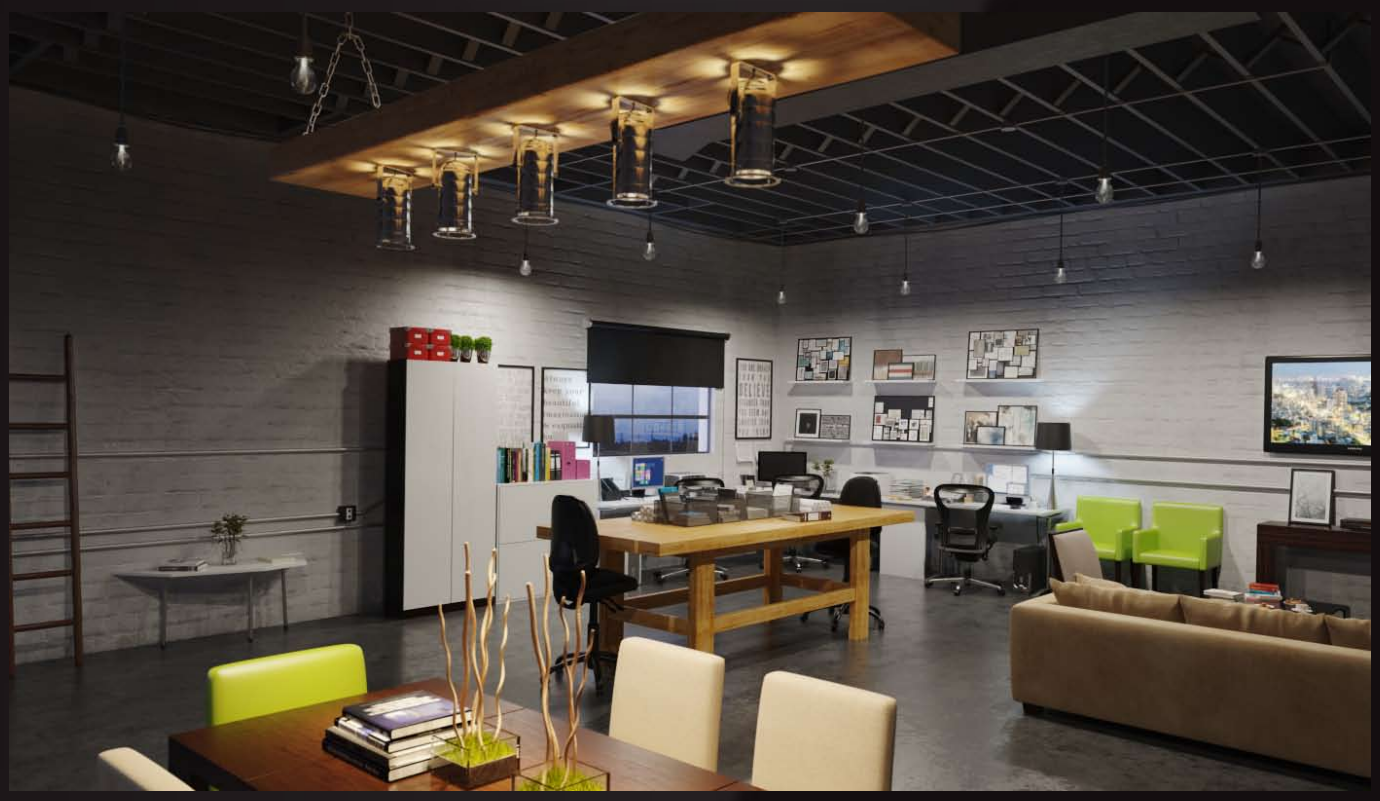
scene 05 raw

Have you ever wanted to make professional interior renderings? Do you know how to use VRaySun, VRaySky and VRayPhisicalCamera? Have you ever had problems with composition? Archexteriors will end all your problems. Take a look at this 10 fully textured scenes with professional shaders and lighting ready to render. Get your own portfolio and join cg market.