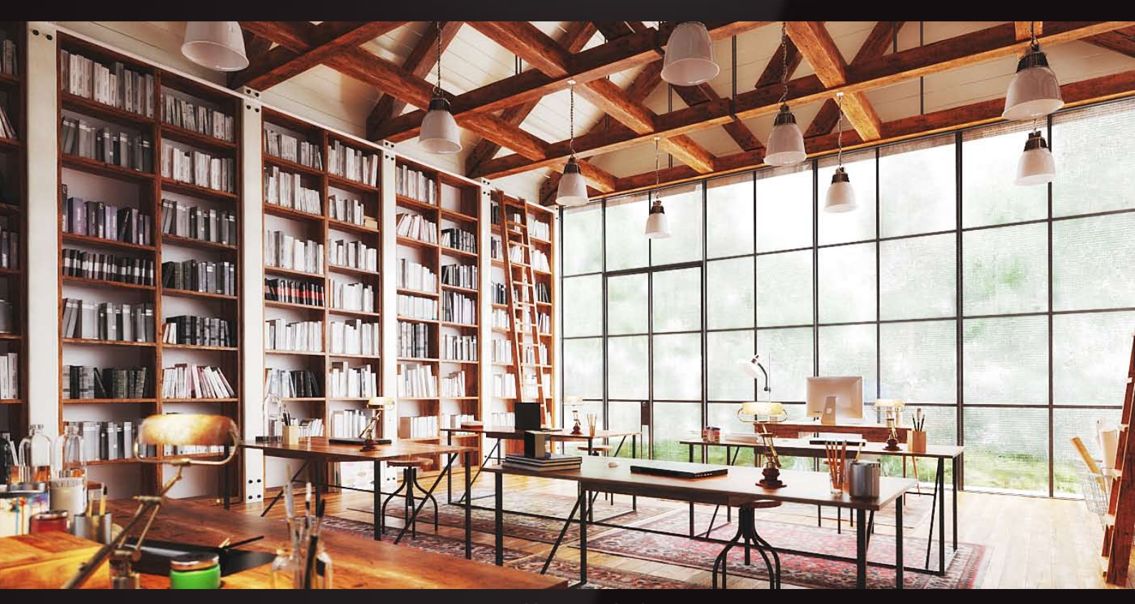
scene 02 post production

Have you ever wanted to make professional interior renderings? Do you know how to use VRaySun, VRaySky and VRayPhisicalCamera? Have you ever had problems with composition? Archexteriors will end all your problems. Take a look at this 10 fully textured scenes with professional shaders and lighting ready to render. Get your own portfolio and join cg market.