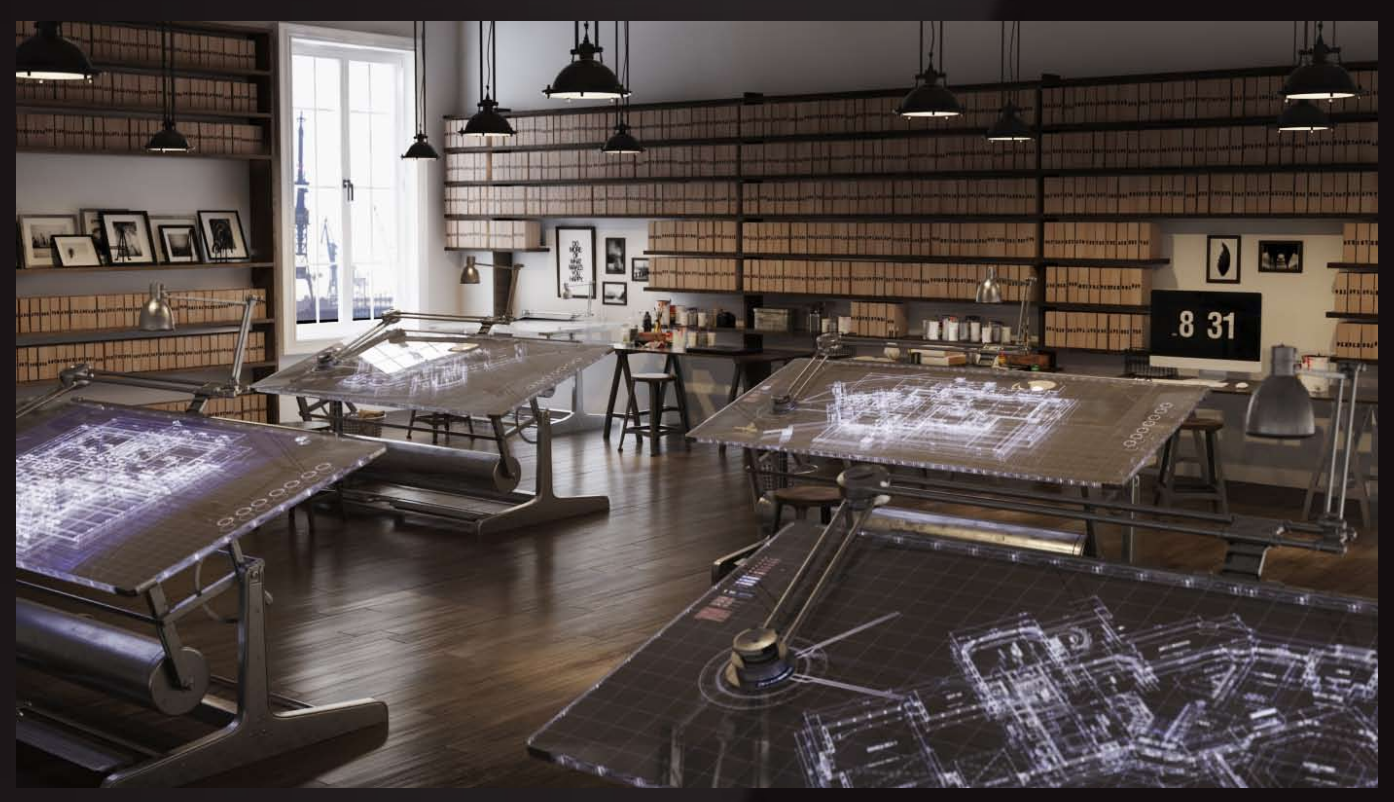
scene 03 raw

Have you ever wanted to make professional interior renderings? Do you know how to use VRaySun, VRaySky and VRayPhisicalCamera? Have you ever had problems with composition? Archexteriors will end all your problems. Take a look at this 10 fully textured scenes with professional shaders and lighting ready to render. Get your own portfolio and join cg market.