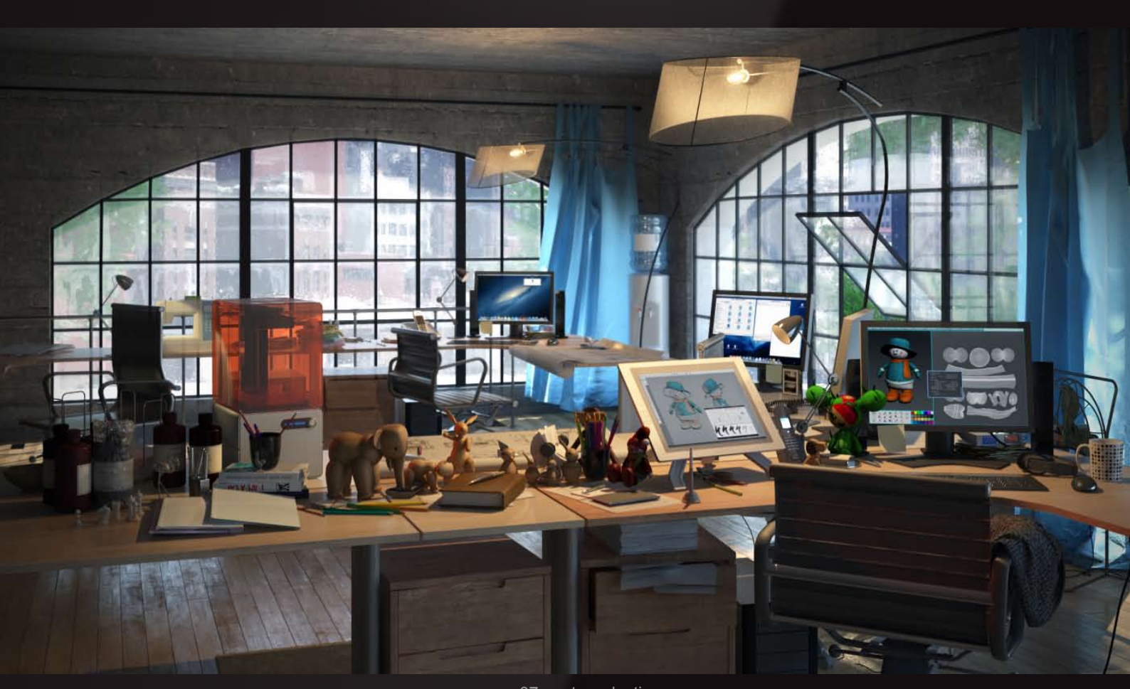
scene 07 post production

Have you ever wanted to make professional interior renderings? Do you know how to use VRaySun, VRaySky and VRayPhisicalCamera? Have you ever had problems with composition? Archexteriors will end all your problems. Take a look at this 10 fully textured scenes with professional shaders and lighting ready to render. Get your own portfolio and join cg market.