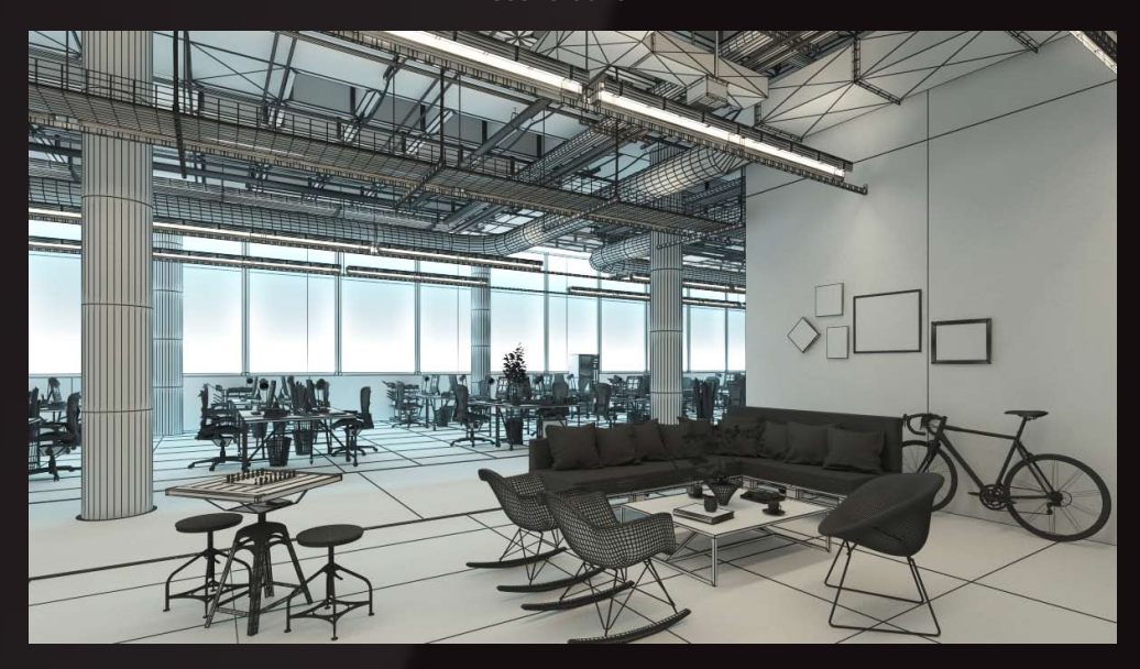
scene 06 wire