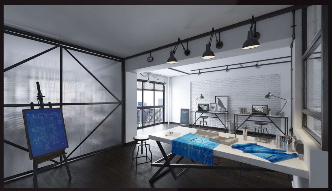
scene 01 raw

Have you ever wanted to make professional interior renderings? Do you know how to use VRaySun, VRaySky and VRayPhisicalCamera? Have you ever had problems with composition? Archexteriors will end all your problems. Take a look at this 10 fully textured scenes with professional shaders and lighting ready to render. Get your own portfolio and join cg market.