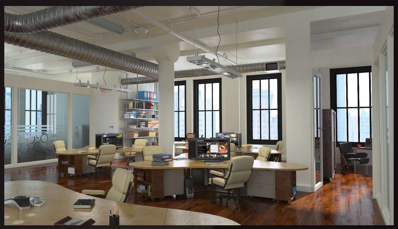
scene 08 raw

Have you ever wanted to make professional interior renderings? Do you know how to use VRaySun, VRaySky and VRayPhisicalCamera? Have you ever had problems with composition? Archexteriors will end all your problems. Take a look at this 10 fully textured scenes with professional shaders and lighting ready to render. Get your own portfolio and join cg market.