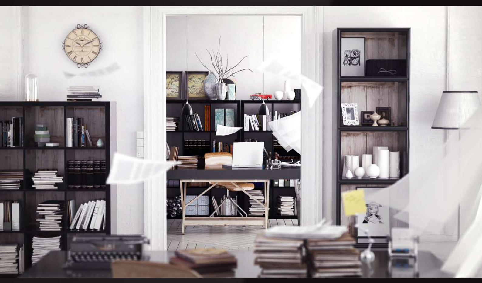
scene 09 post production

Have you ever wanted to make professional interior renderings? Do you know how to use VRaySun, VRaySky and VRayPhisicalCamera? Have you ever had problems with composition? Archexteriors will end all your problems. Take a look at this 10 fully textured scenes with professional shaders and lighting ready to render. Get your own portfolio and join cg market.