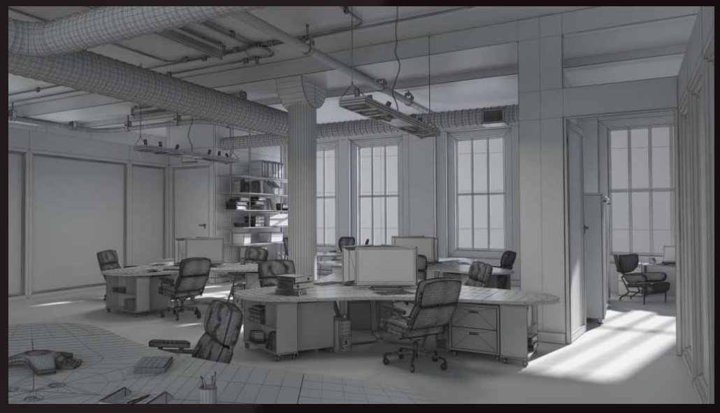
scene 08 wire