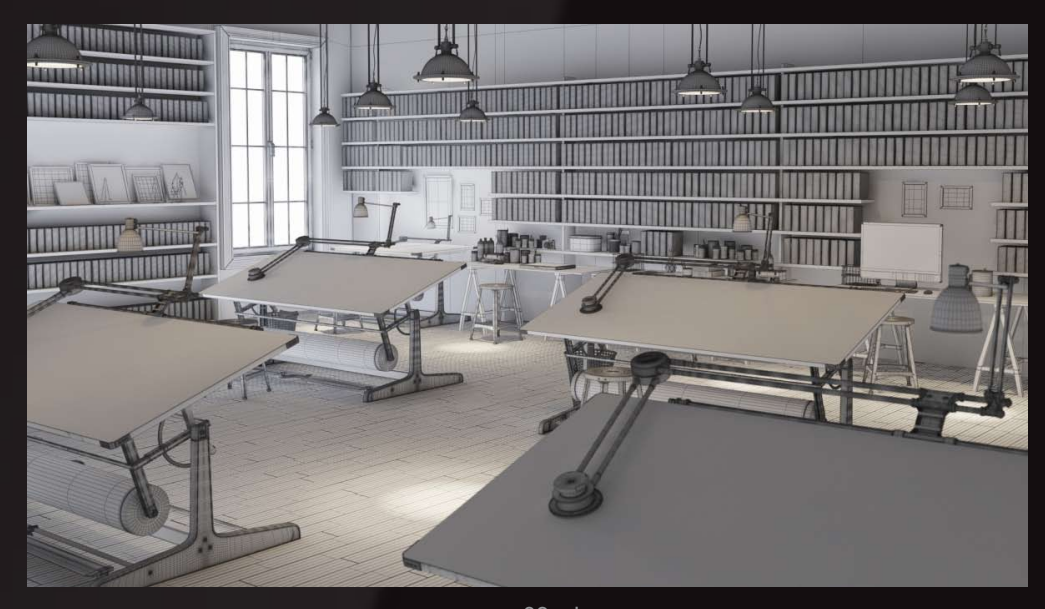
scene 03 wire