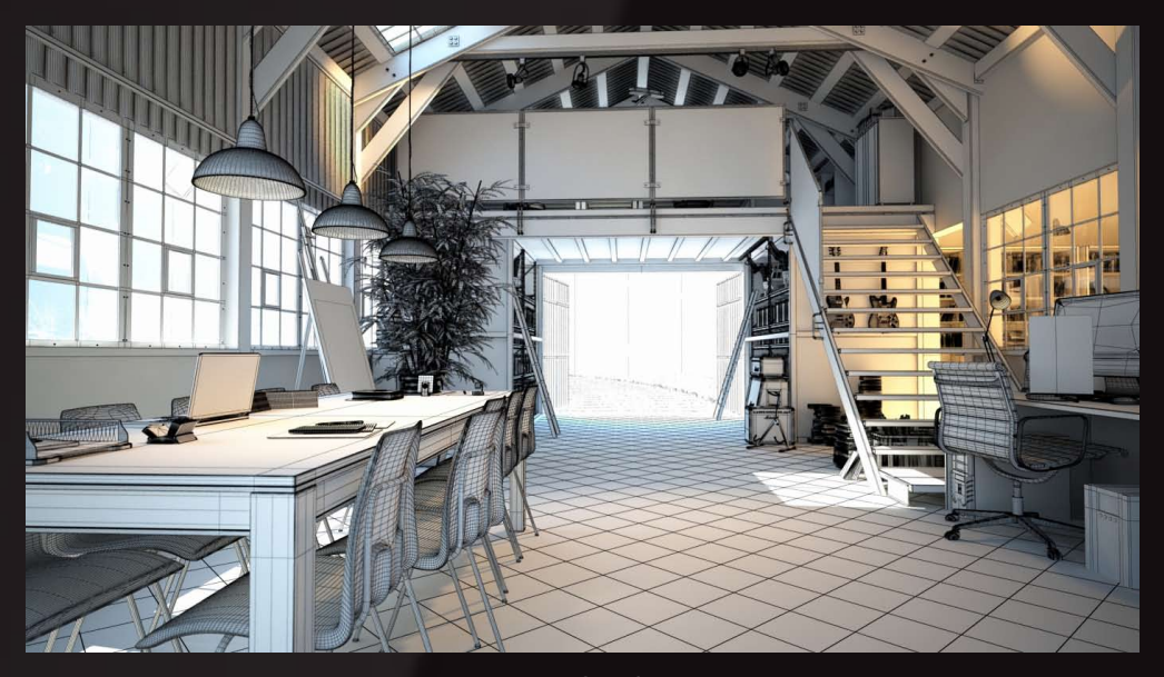
scene 04 wire