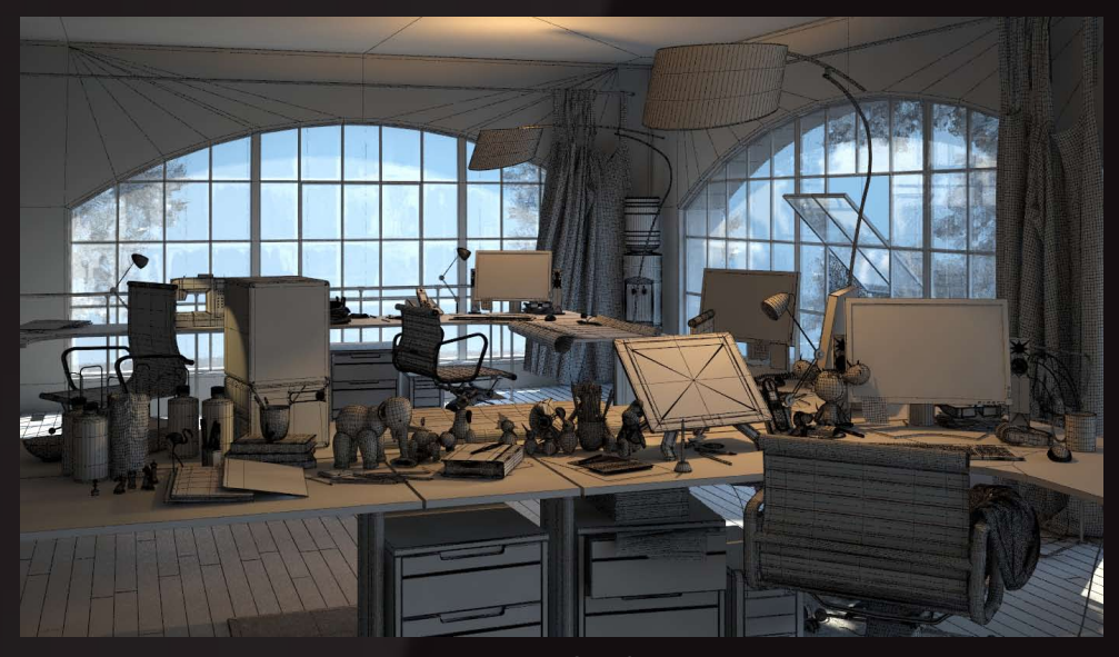
scene 07 wire