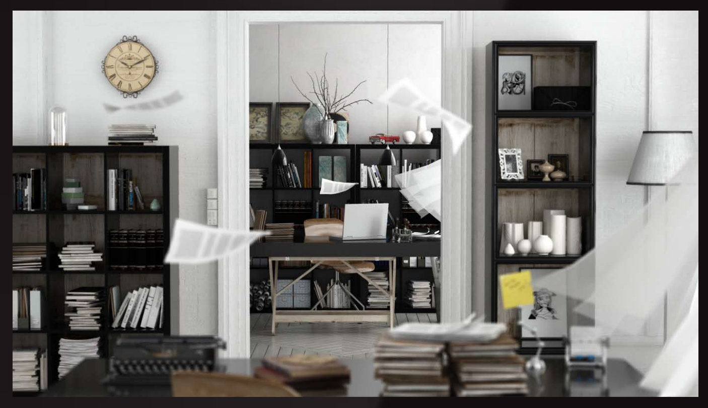
scene 09 raw

Have you ever wanted to make professional interior renderings? Do you know how to use VRaySun, VRaySky and VRayPhisicalCamera? Have you ever had problems with composition? Archexteriors will end all your problems. Take a look at this 10 fully textured scenes with professional shaders and lighting ready to render. Get your own portfolio and join cg market.