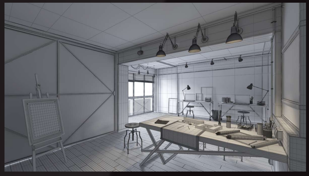
scene 01 wire