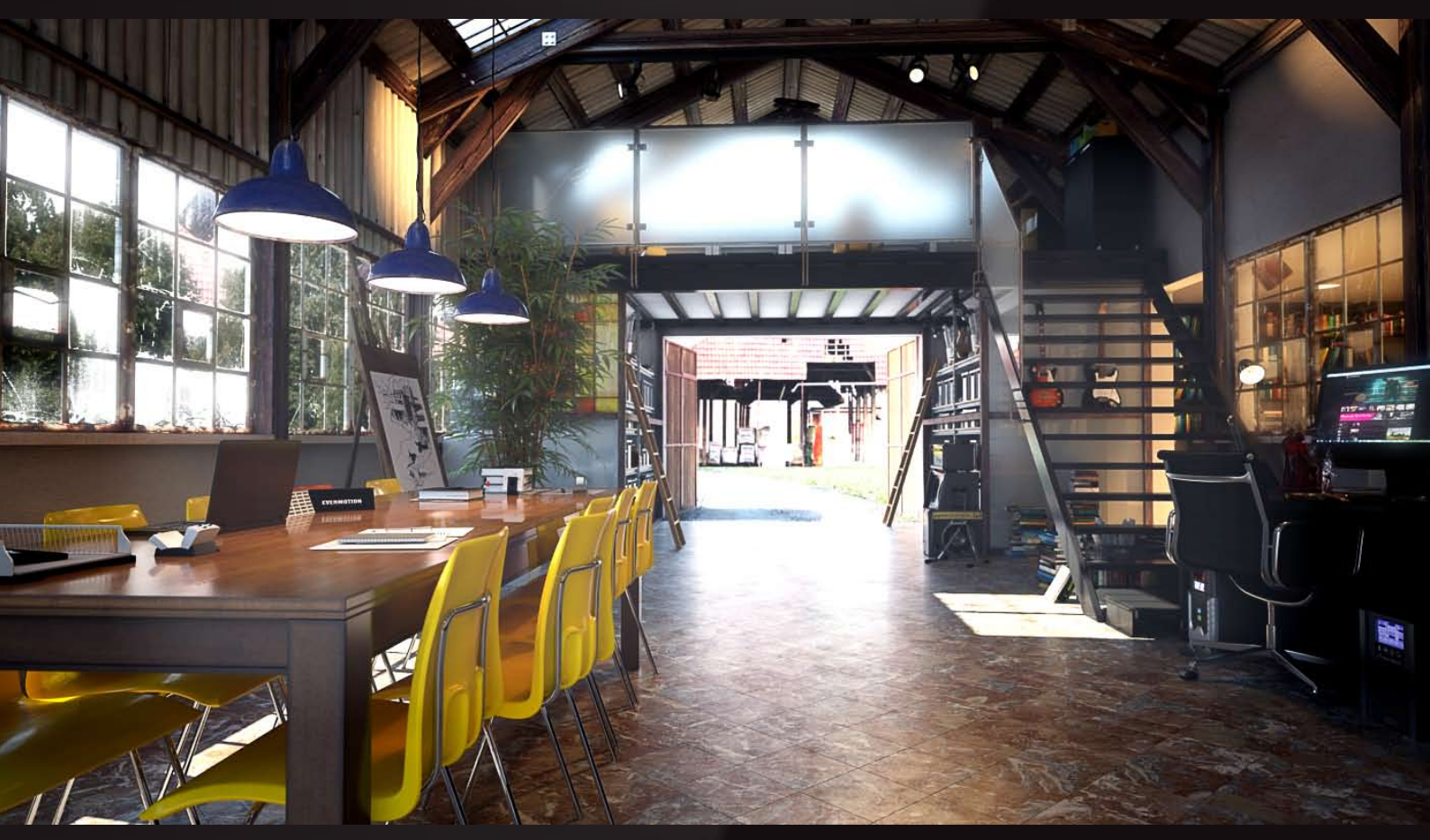
scene 04 post production

Have you ever wanted to make professional interior renderings? Do you know how to use VRaySun, VRaySky and VRayPhisicalCamera? Have you ever had problems with composition? Archexteriors will end all your problems. Take a look at this 10 fully textured scenes with professional shaders and lighting ready to render. Get your own portfolio and join cg market.