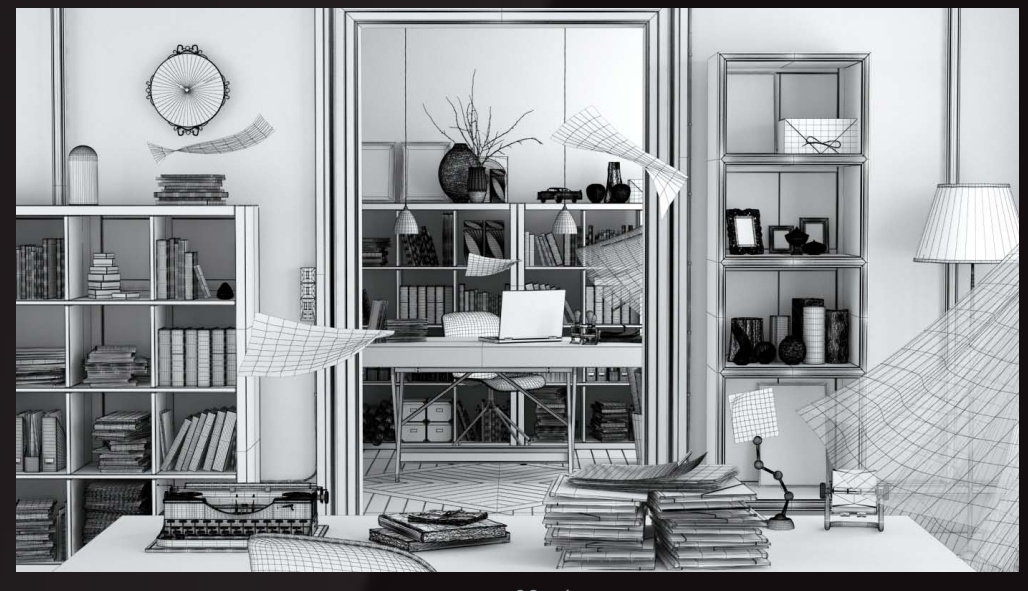
scene 09 wire