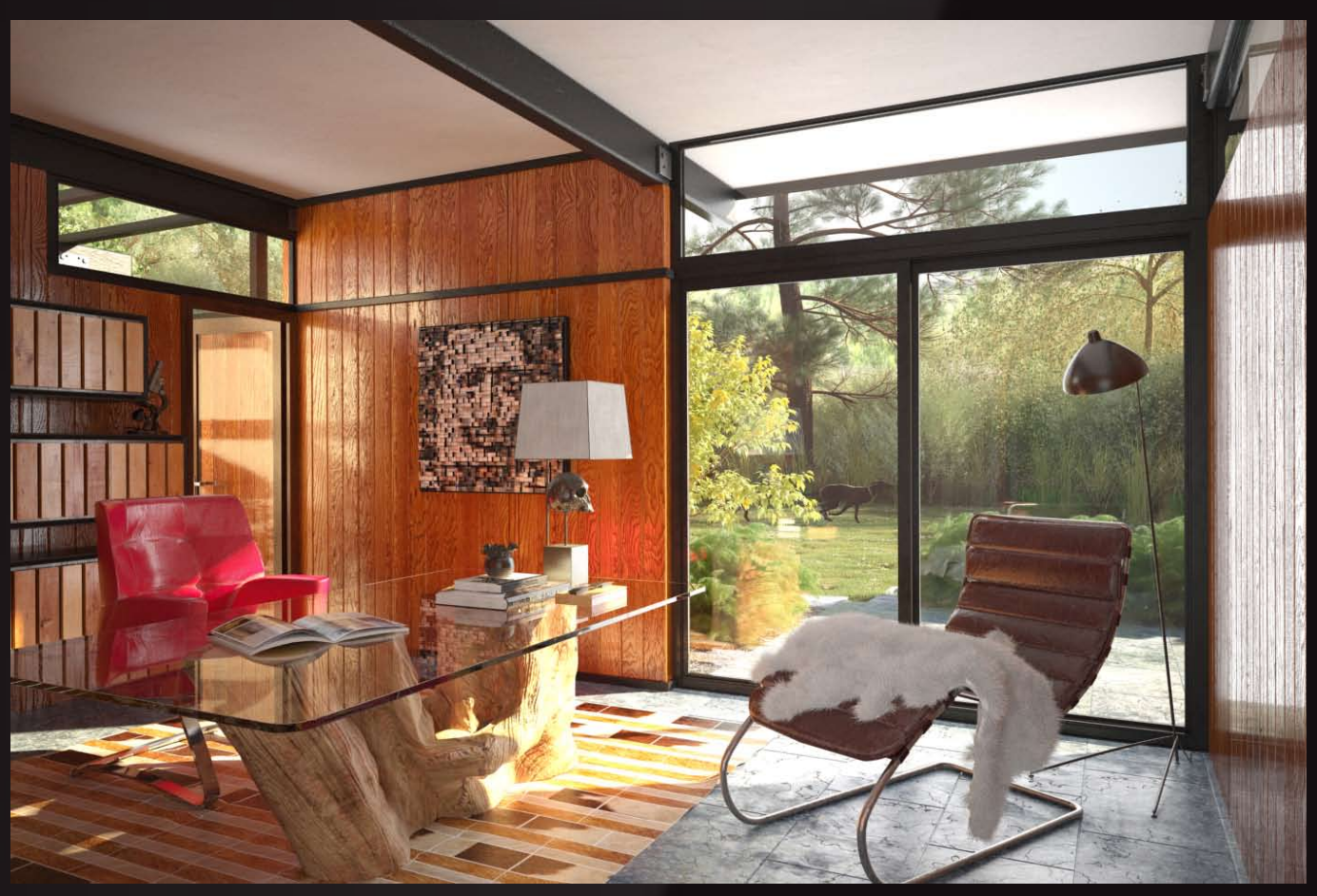
scene 10 raw

Have you ever wanted to make professional interior renderings? Do you know how to use VRaySun, VRaySky and VRayPhisicalCamera? Have you ever had problems with composition? Archexteriors will end all your problems. Take a look at this 10 fully textured scenes with professional shaders and lighting ready to render. Get your own portfolio and join cg market.