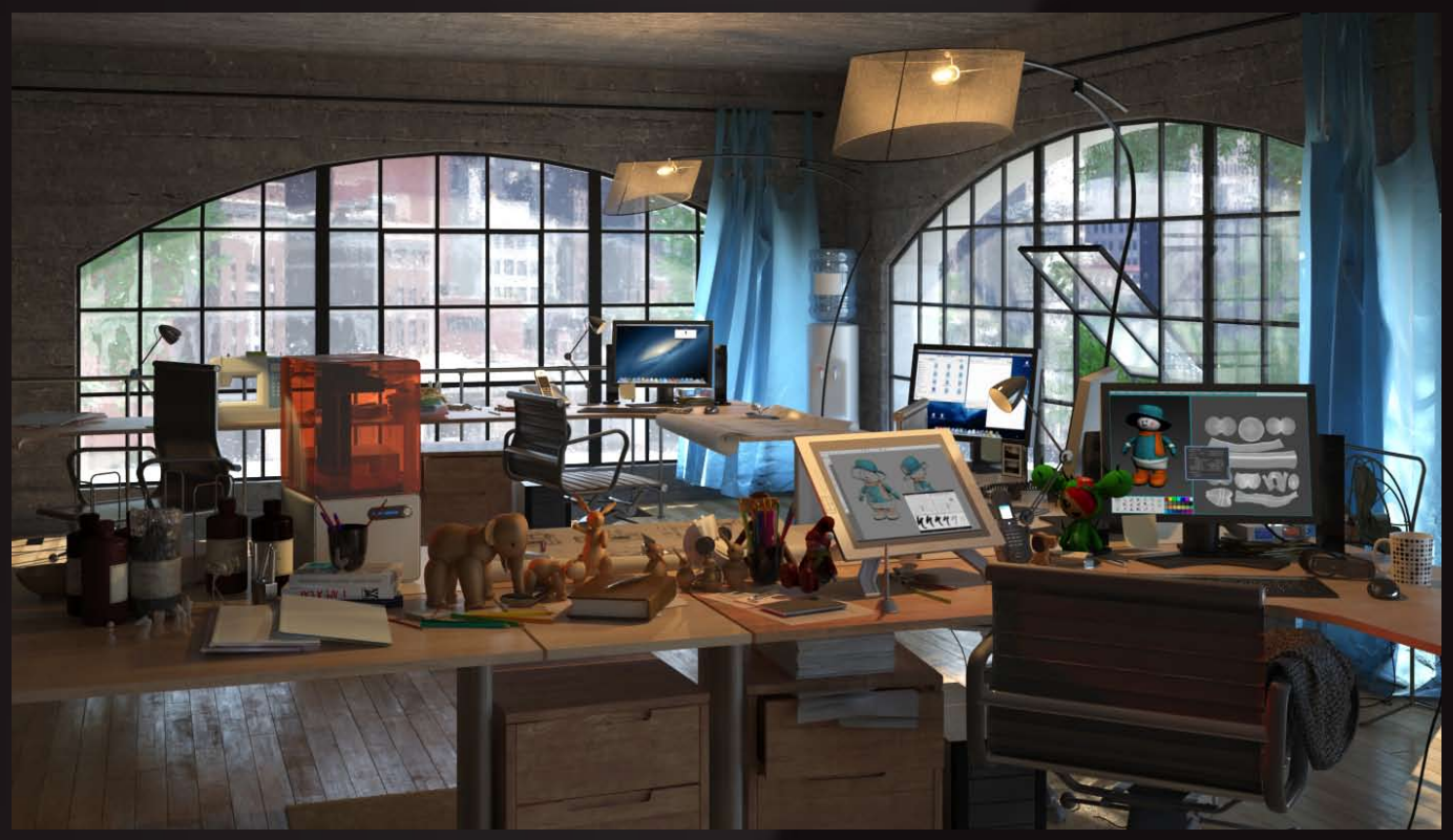
scene 07 raw

Have you ever wanted to make professional interior renderings? Do you know how to use VRaySun, VRaySky and VRayPhisicalCamera? Have you ever had problems with composition? Archexteriors will end all your problems. Take a look at this 10 fully textured scenes with professional shaders and lighting ready to render. Get your own portfolio and join cg market.