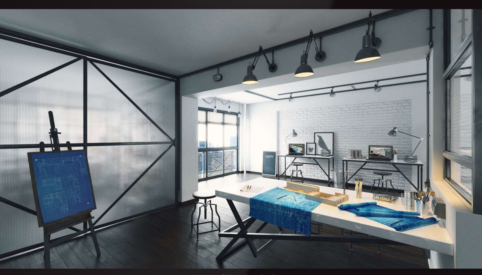
scene 01 post production

Have you ever wanted to make professional interior renderings? Do you know how to use VRaySun, VRaySky and VRayPhisicalCamera? Have you ever had problems with composition? Archexteriors will end all your problems. Take a look at this 10 fully textured scenes with professional shaders and lighting ready to render. Get your own portfolio and join cg market.