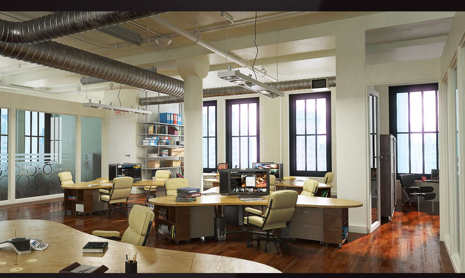
scene 08 post production

Have you ever wanted to make professional interior renderings? Do you know how to use VRaySun, VRaySky and VRayPhisicalCamera? Have you ever had problems with composition? Archexteriors will end all your problems. Take a look at this 10 fully textured scenes with professional shaders and lighting ready to render. Get your own portfolio and join cg market.