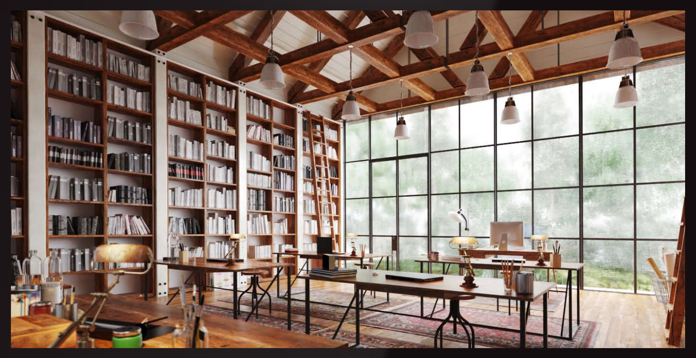
scene 02 raw

Have you ever wanted to make professional interior renderings? Do you know how to use VRaySun, VRaySky and VRayPhisicalCamera? Have you ever had problems with composition? Archexteriors will end all your problems. Take a look at this 10 fully textured scenes with professional shaders and lighting ready to render. Get your own portfolio and join cg market.