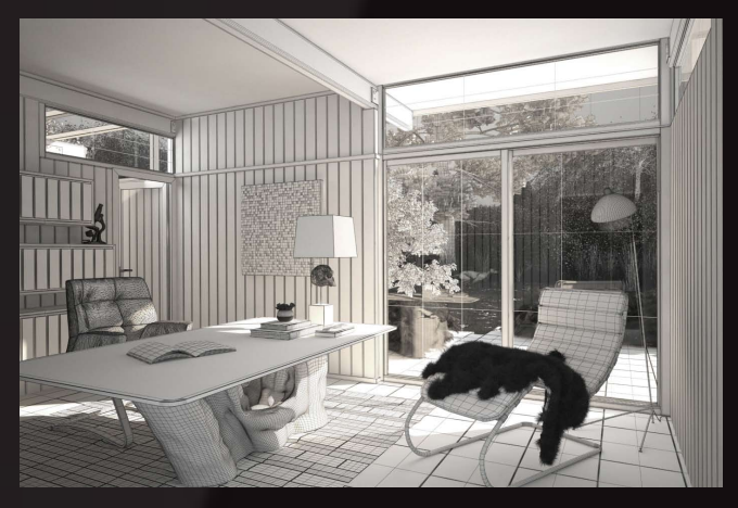
scene 10 wire