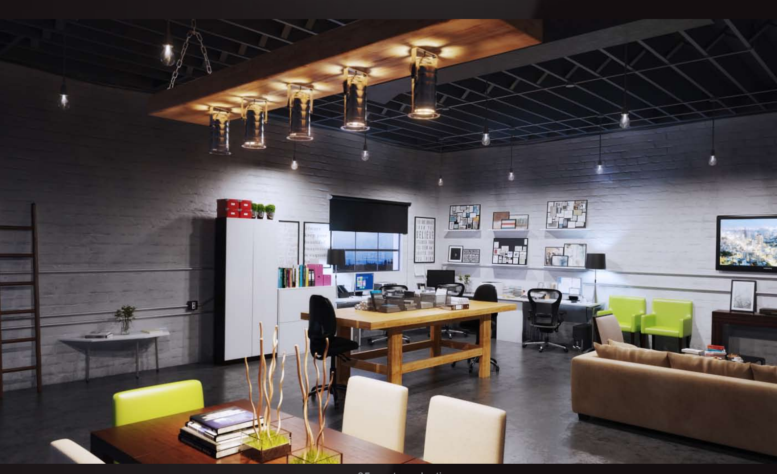
scene 05 post production

Have you ever wanted to make professional interior renderings? Do you know how to use VRaySun, VRaySky and VRayPhisicalCamera? Have you ever had problems with composition? Archexteriors will end all your problems. Take a look at this 10 fully textured scenes with professional shaders and lighting ready to render. Get your own portfolio and join cg market.