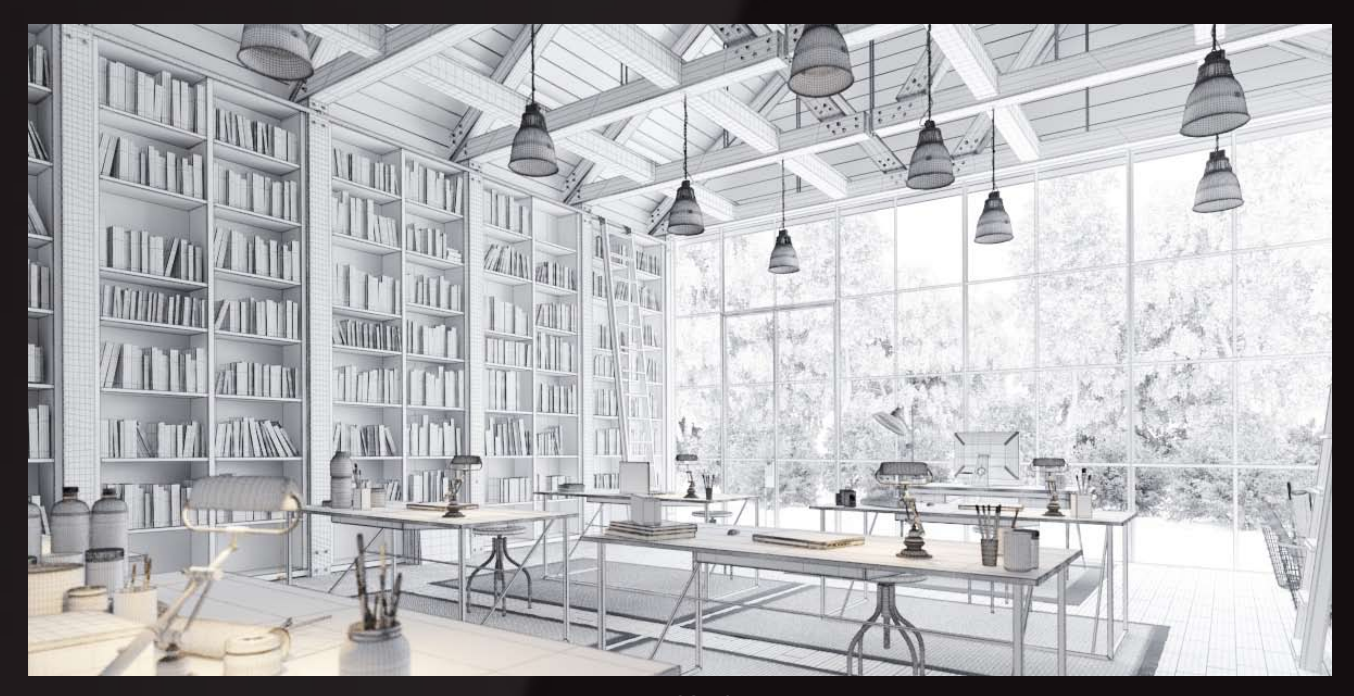
scene 02 wire