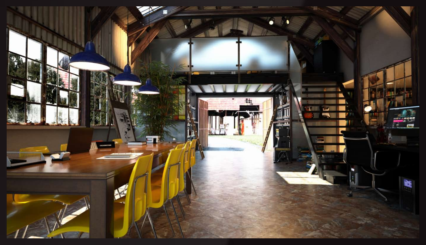
scene 04 raw

Have you ever wanted to make professional interior renderings? Do you know how to use VRaySun, VRaySky and VRayPhisicalCamera? Have you ever had problems with composition? Archexteriors will end all your problems. Take a look at this 10 fully textured scenes with professional shaders and lighting ready to render. Get your own portfolio and join cg market.